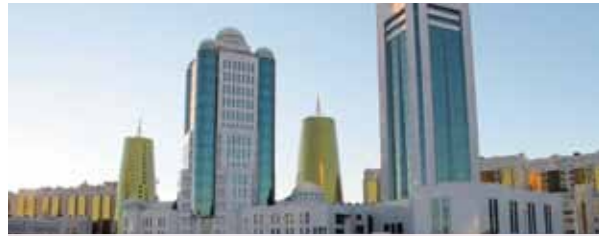
The Kazakh parliament building in the heart of Astana, the capital.