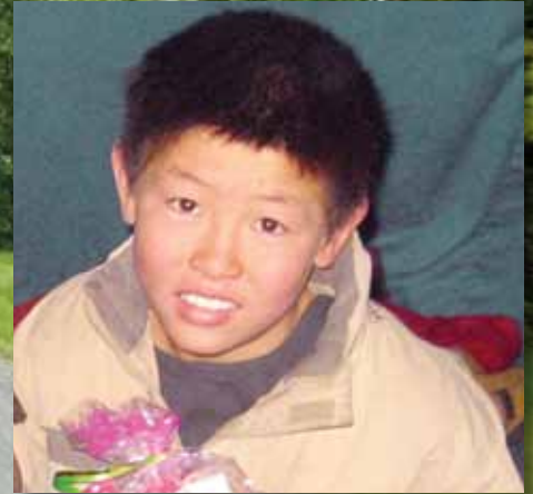
SGA-sponsored missionary pastors find open hearts for the Gospel among Mongolian children.