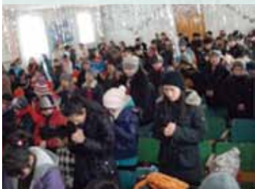
Responding to the Gospel in a Mongolian church!

of about 20 people, followed by a discussion to answer questions about repentance and having a relationship with Christ. At the end, three people repented and gave their hearts to the Lord Jesus.