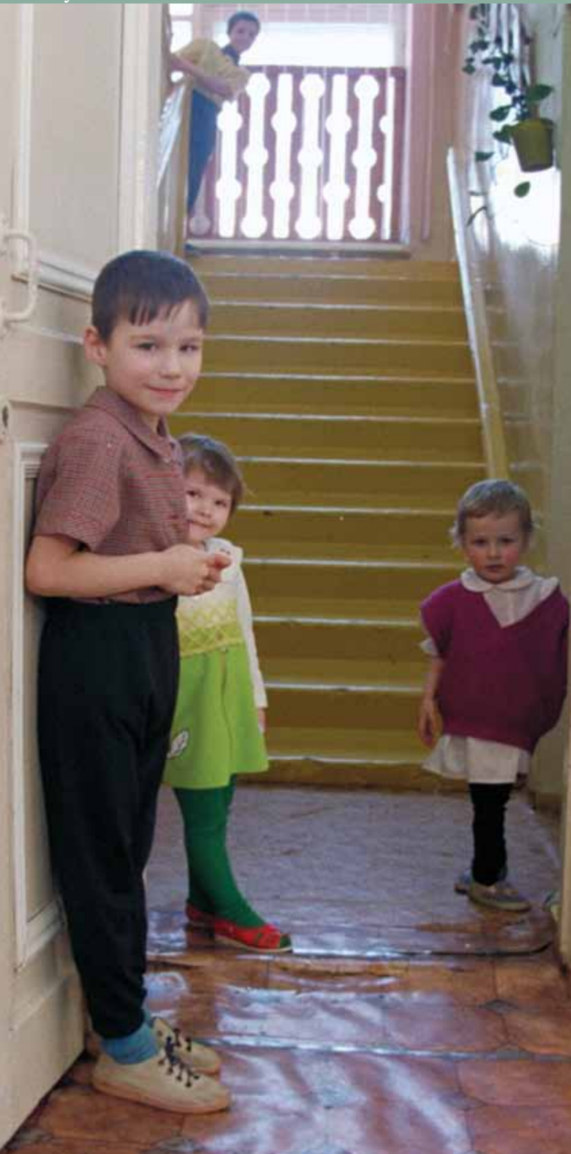
Russian orphans . . . waiting to hear of God's love.