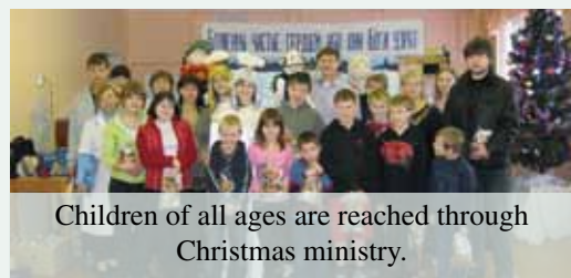
Children of all ages are reached through Christmas ministry.

These kids — ages 15 to 16 — were not familiar with us and were very skeptical. At first, they laughed at us. But as the program proceeded, they became very silent and listened to us attentively. Adults and educators also watched our play. Some had tears in their eyes and sincerely thanked us for the program and the gifts for the children. There were also outreaches in Sovetsk, Velikoretskoye, and Fileika. Thank