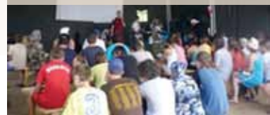
The gathered youth listened intently to the biblical truth presented during the sessions.

and evening meetings, as well as for different sports events. Last August, we had 90 youth from across the Far East in the camp.