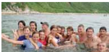
Youth swimming in Livadia Hardor before the morning session.

After crossing over our simulated "Customs Control" and filling out their "Declaration Form" in order to enter our "Megalopolis," the participants were divided into teams. Even before the beginning of the camp, the leaders — some of whom had many years of experience in youth ministry — knew the names of the young people in their teams and were praying for them by name. Each morning began with sports activities and