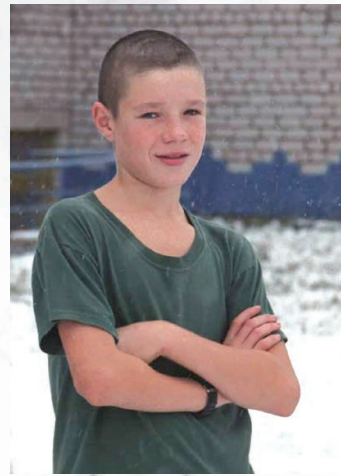
Without warm clothing, this boy’s future is dire.

the Lord used this massive effort to help open the door for SGA-sponsored missionary pastors to demonstrate Christ’s love and to share the Gospel with unbelievers.