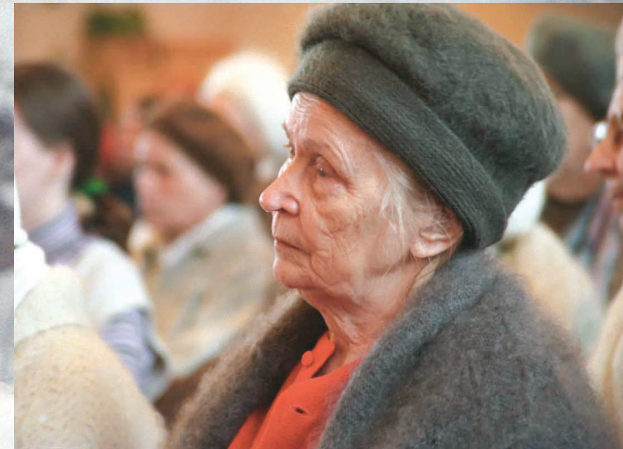
Children and elderly throughout the former Russian-speaking lands need warm clothing and jackets to survive the winter months.

children, orphans, and the elderly who are neglected and alone. In so doing, they are living examples of our compassionate God whose Word declares . . . Pure and undefiled religion in the sight of our God and