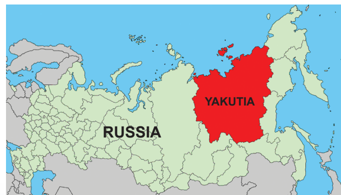
Yakutia (Sakha Republic) is the largest subdivision of the Russian Federation but has one of the least dense populations.