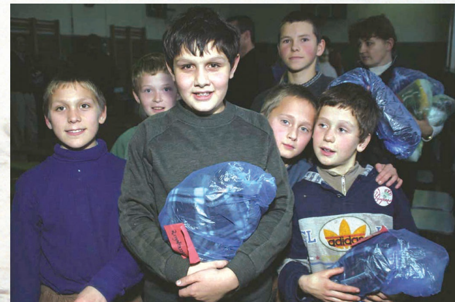
Through your support of Operation Winter Warmth , we are able to put warm winter clothing into needy hands like these.

father is this: to visit orphans and widows in their distress, and to keep oneself unstained by the world (James 1:27). We will update you on this ministry in future issues of the Good News Report. ♦