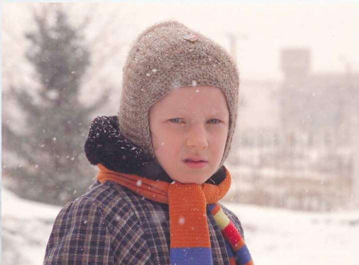
Providing warm clothing and heat is an opportunity to show Christ’s love and compassion to those in need.

In the winter of 2002, Russia was in the midst of a serious economic crisis. Thousands of individuals and families were destitute and uncertain how they were going to survive the cold. To help Russian evangelical churches respond to that great need, SGA launched Operation Winter Warmth with the help of our partners. Tons of warm clothing, footwear, and other aid were placed in the hands of those who desperately needed it, as well as thousands of Russian-language copies of God’s Word. Most wonderful of all,