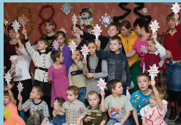
The Immanuel's Child program reaches children throughout the region.

As we begin 2018, our hearts are so deeply thankful to the Lord for what He has done over the past year through your generous support and faithful prayers. In future issues of the Good News Report,