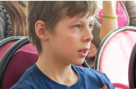
The Jesus film and other Gospel presentations hold the children in rapt attentiveness.

At Easter, we showed the Jesus film, which the boys watched with open mouths and eyes! At one orphanage where we took the film, the room was so quiet that the teachers who passed by looked us in the room and could not believe that the children were so quiet! After the film, some boys came up to us to share their innermost feelings, and we prayed with them about their problems! The Lord is doing His work in them, and in all of us!