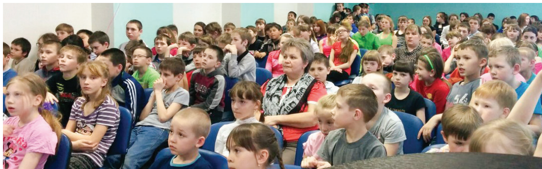
Tens of thousands of children have been reached through your prayers and faithful support of the SGA-sponsored Orphans Reborn ministry.

Thank you, dear brothers and sisters, for our work together with you on God's harvest field, and for the financial and prayer support you have given us! May God richly bless your homes and families!