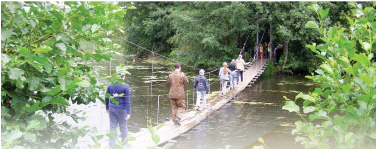
Children remember summer camp for a lifetime, with many coming to faith in Christ.

Please pray in advance for the camp sessions being planned in Russia, Ukraine, Belarus, the Caucasus republics, across Central Asia and in Israel where opposition to the Gospel is so strong. As boys and girls hear about Christ's love for them, may He draw many boys and girls to Himself.