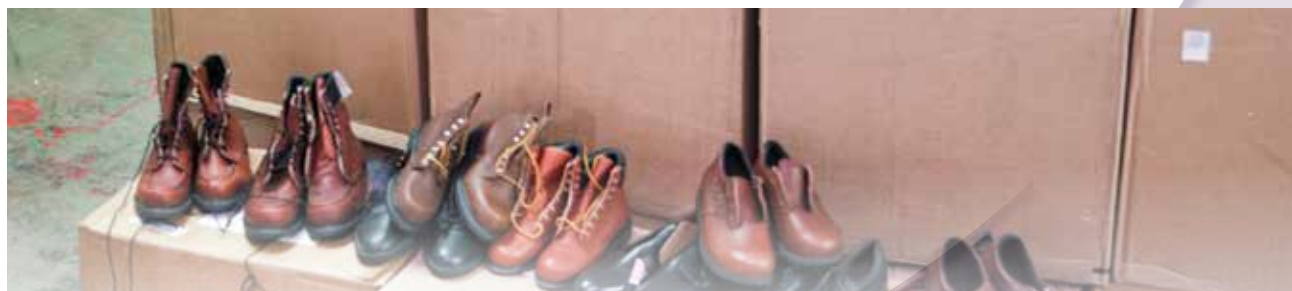
Thousands of quality shoes and boots were shipped through the generous donation of a major footwear company and the initiative of BEFC members.

But the most amazing way God multiplied the sacrificial giving of this church came in 1996. After the collapse of the Soviet