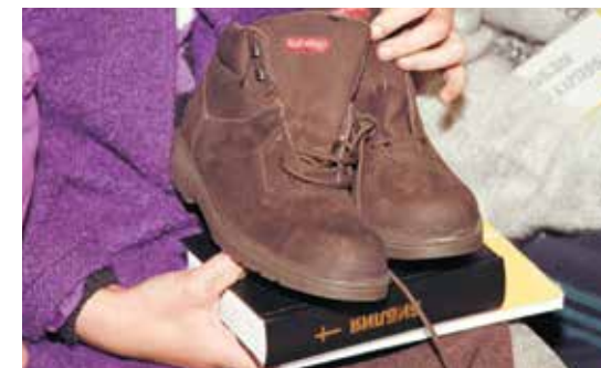
... having shod your feet with the preparation of the Gospel of peace (Ephesians 6:15)