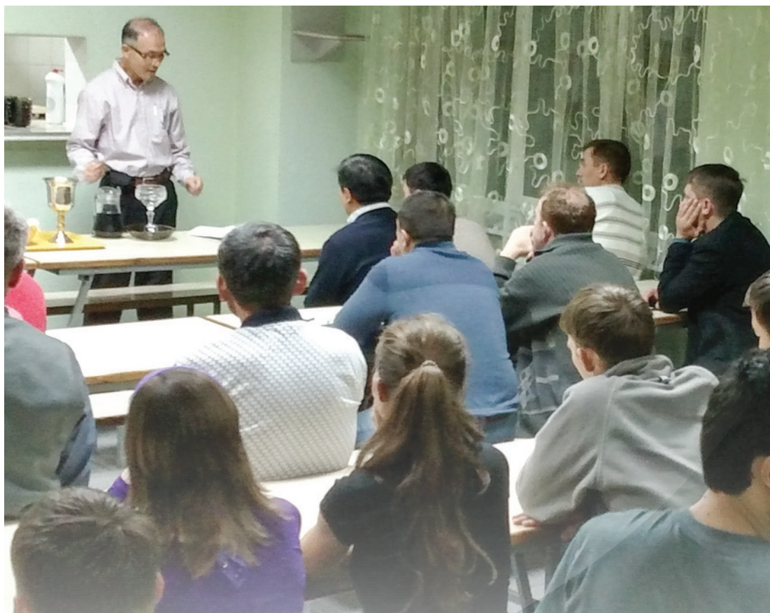
Almaty Bible Institute students and teachers share the Lord's Supper.

God. It is not easy to describe. God helps me through the brothers who teach here. Every subject that we had this year, to some extent helps me as I preach the Gospel. I am grateful to the Lord that He put it in the hearts of brothers and sisters in North America to give financially to the cause of Christ, and their work is not in vain in the sight of God! (1 Corinthians 15:58). Personally, it is very important to me that you have given me an opportunity to study. After all, we are doing one work together in order to reach people. Thank you for helping us and may God bless you!