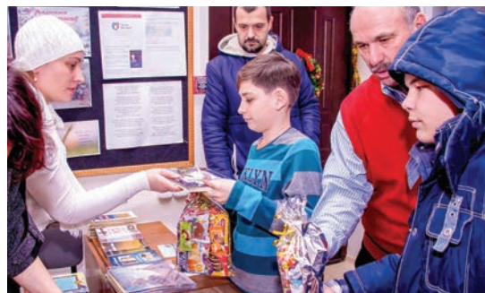
A gift given in Jesus' name helps open a young heart to the Gospel.

There are children who know the Bible story, while there are others who think it is a real story but do not know why. We asked them, "Is