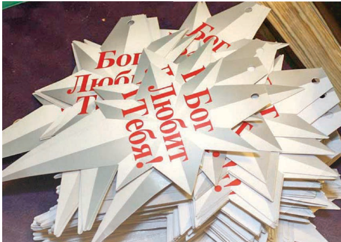
These Bethlehem Stars remind the children that Jesus loves them, and that an SGA partner is praying for them.