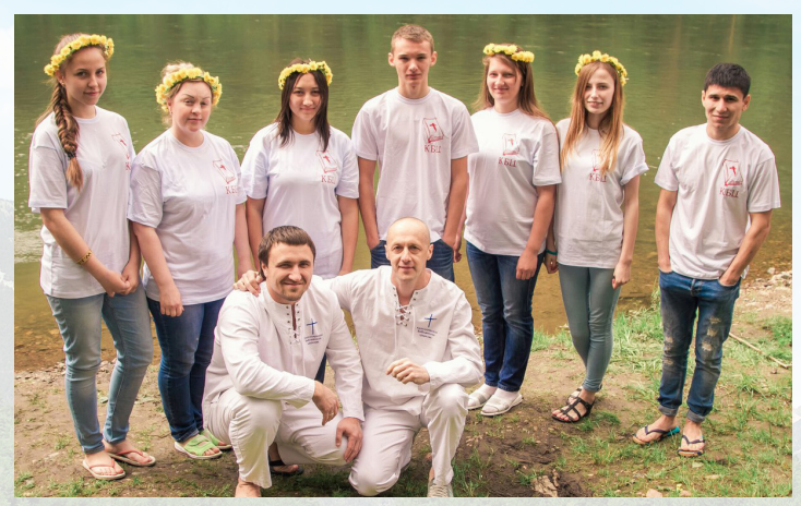
Sevin youth committed their lives to the Lord.

tore all of his official documents to pieces including his passport. He then threw them away.