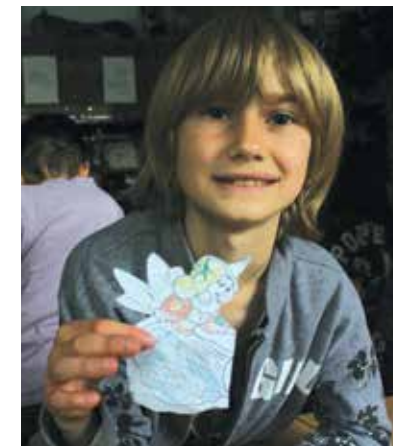
The younger children at the orphanage are very appreciative of the guidance they get from the graduates.