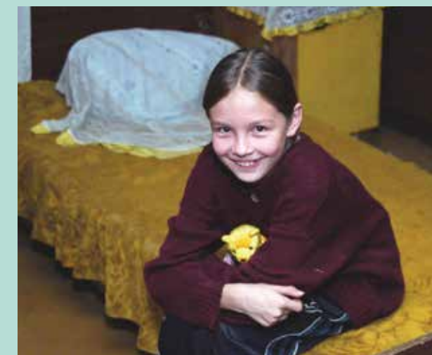
With your help, we can bring hope and Christ to orphans in need.

Your prayers and generous support accomplish so much more in serving Bible-preaching churches in the CIS—providing Russian-language Bibles and Christian literature, Bible training, children's ministries, compassion ministry, and help for missionary pastors in the field proclaiming the Gospel. Please pray about how you can help today! ♦