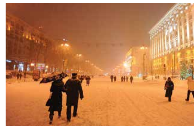
Khreshchatyk street, Kiev, Ukraine

The United Nations Office for the Coordination of Humanitarian Affairs says up to 4 million people in Ukraine are facing a “desperate situation” as winter progresses in Ukraine. The country is in its fourth year of war in the eastern regions—a conflict that has claimed up to 10,000 people and injured 23,500 others. Spokesman Jens Laerke said most of the people in urgent need are in the separatist