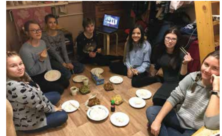
The girls who have graduated from the home meet weekly.

and regular families. We read the Bible together, encourage each other and pray for one another.