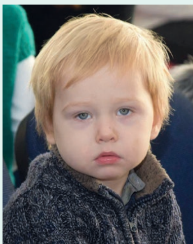
Children throughout the CIS need the hope of Christ.

Since SGA's Reach Russia Now initiative began in late 2017, we have been praying for opportunities to help evangelical churches in the Far East to step up their ministries in this huge unreached region. The Lord answered those prayers in a wonderful way through Immanuel's Child outreaches this Christmas. And not just in the Far East.