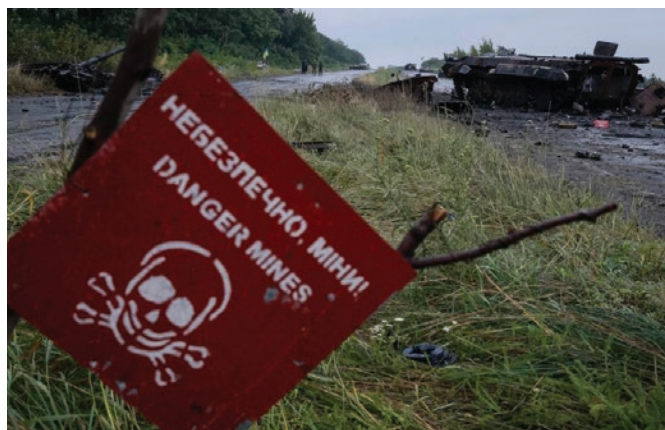
Landmine warning sign in Eastern Ukraine

What you can do: This tragic situation underscores the need to support faithful SGA-sponsored missionary pastors as they deliver humanitarian aid through our Crisis Evangelism Fund , and share the hope found only through the Gospel. Please pray for their safety as they travel across the region, and pray for a peaceful end to the conflict. ♦