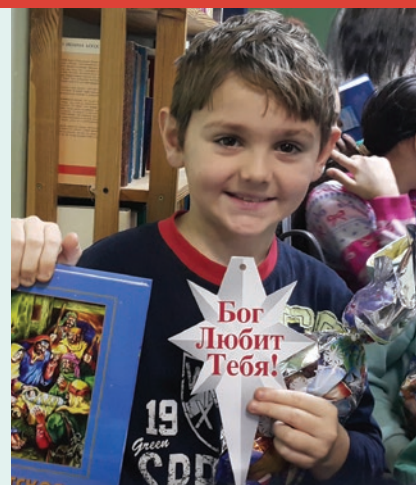
Through Immanuel's Child children learn of God's love.

"It was awesome! The play ended with a message from one of the team members about the true meaning of Christmas. The kids were engaged and the parents were smiling. A parent told us afterward, 'I never