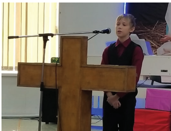
A young man of only 11 years preached at the event.