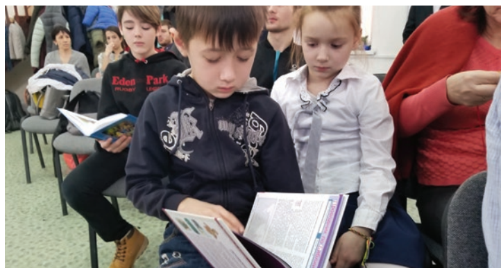
The children learned the Christmas story at the event.