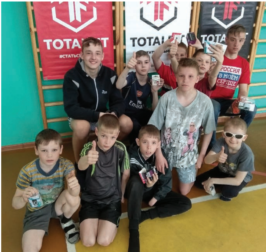
Through Orphans Reborn you are able to bring God's love to so many!

"I am especially enthused with their desire and commitment to act according to the truth that they learn."