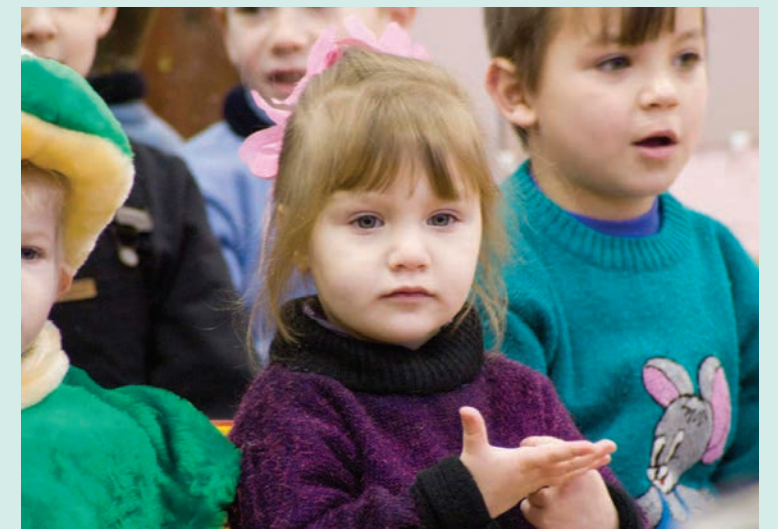
Your gifts help bring the love of Christ to orphans and children throughout the Russian speaking lands.

Your gifts to SGA's ministries help accomplish so much—provision of Bible training, children's ministries, summer camps, food and material aid through Compassion Ministry, Russian-language Bibles, Christian literature, youth ministry, missionary pastor sponsorship, and much more. Please pray about how you can help today!