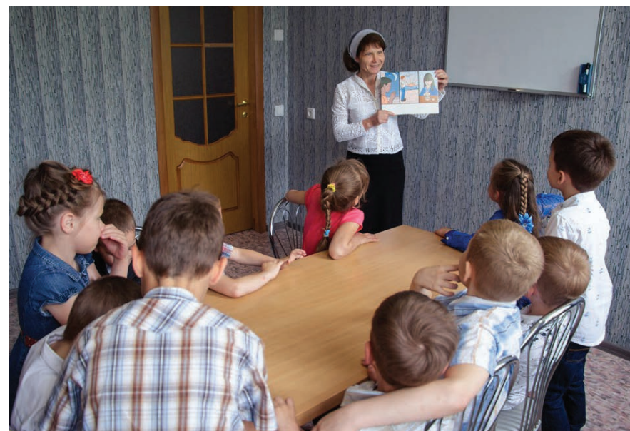
Your support has brought Sunday school to children in Ukraine and throughout the lands of the former Soviet Union.

Sunday school supplies were also distributed to children who had attended Immanuel's Child Christmas programs back in January. None of it could have been done without you—our faithful partners. Please pray for peace to come to eastern Ukraine soon. Pray also that God will provide more urgently needed resources for SGA's Crisis Evangelism Fund, which assists needy families with humanitarian aid as well as Bibles and evangelistic literature.