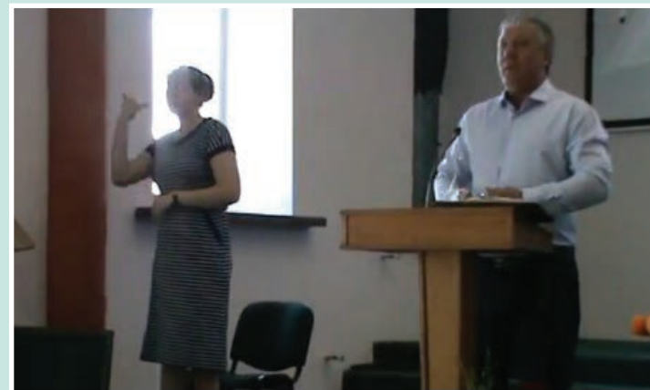
A sign language interpreter means so much to those that cannot hear.

I was baptized and became active in different ministries in the Kherson church. The church in Kherson had been praying a long time for sign language interpreters because they are a large