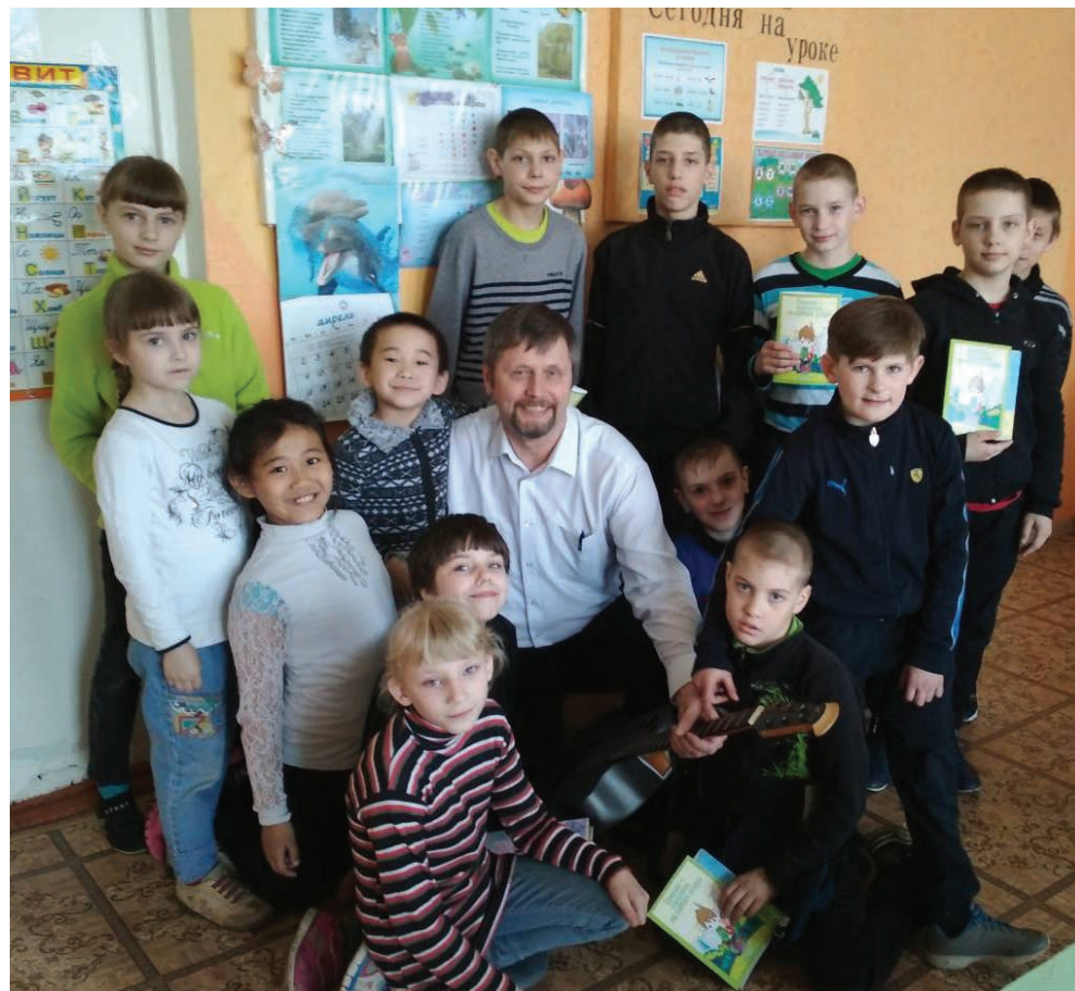
Through your support, the children learn the true story of Easter, and the love Christ has for them.

We wanted them to know that Easter is not about colored eggs or a bunny. We shared the whole story, discussed it together, sang a lot of songs, made some crafts with the small children, and gave them small prizes. We also noticed that the teachers listened especially attentively. It was an important