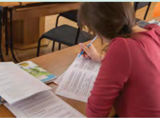
God is at work, using your support to train Christian leaders at Irpen and the other SGA programs.

This situation once again shows how the Chernobyl tragedy continues to devastate lives more than 30 years after the accident. Please intercede for the evangelical churches in Ukraine and Belarus who minister in these regions. Pray also for the SGA-supported Little Pear Children's Diagnostic Camp in the town of Kobrin as they support children affected by the residual radiation. •