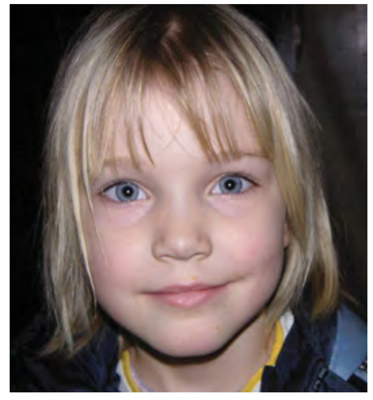
Orphans throughout Russian-speaking countries learn the eternal truth of the resurrection of Christ.

We visited the children's home in the city of Donetsk for the first time. The staff greeted us warmly and invited us to come again. One of the instructors approached us afterward and appeared concerned that we were "sectarian," but we convinced her that the Gospel truths we were