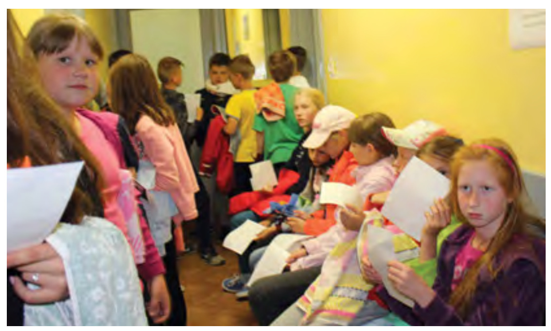
Poverty throughout the country of Georgia has forced patients to wait for critical medical attention.

Irpen is just one instance. Orphans Reborn, Bible Camps, Immanuel's Child, and strong churches themselves are part of an interwoven network of God's love and grace that is growing in the former USSR. God is at work. And He's working through you! Please pray about making your next gift today to be an even greater part of the story.