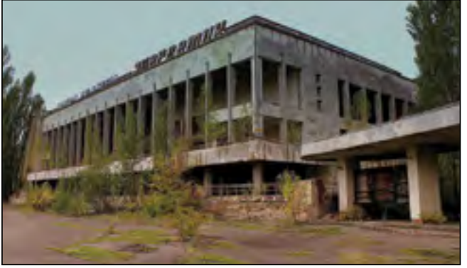
Soviet authorities resettled more than 350,000 people after the accident but many more still live in contaminated areas.

A recent article in Environment International is raising concerns over milk contaminated by residual radiation from the Chernobyl nuclear accident in Ukraine. The report claims that milk from Ukrainian villages 150 miles away from Chernobyl is five times more radioactive than the government judges to be safe. The report adds that unless officials properly intervene, the radioactivity levels will not reach the safe limit until at least 2040. In another Chernobyl-related incident, a forest fire in June raged for several days in the restricted zone around the nuclear plant. However, authorities said there was no radiation increase detected in the air around the plant or in Kiev.