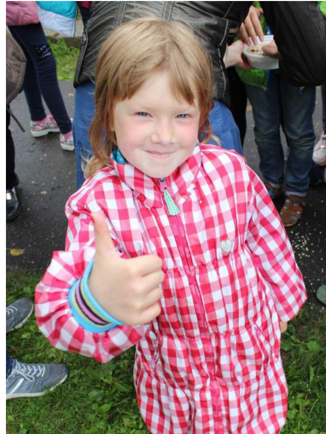
Learning about Jesus was a highlight of the camp for many of the children.

Although the camp session came to an end, our ministry with the children and their families did not. We followed up afterward, visiting their homes and bringing them food parcels, and then inviting them to come to the church. Thanks be to God for this ministry, and I am very thankful to you for your help in purchasing food and the colorful children’s literature. The seeds of God’s Word have been planted and will bring fruit in His time! ♦