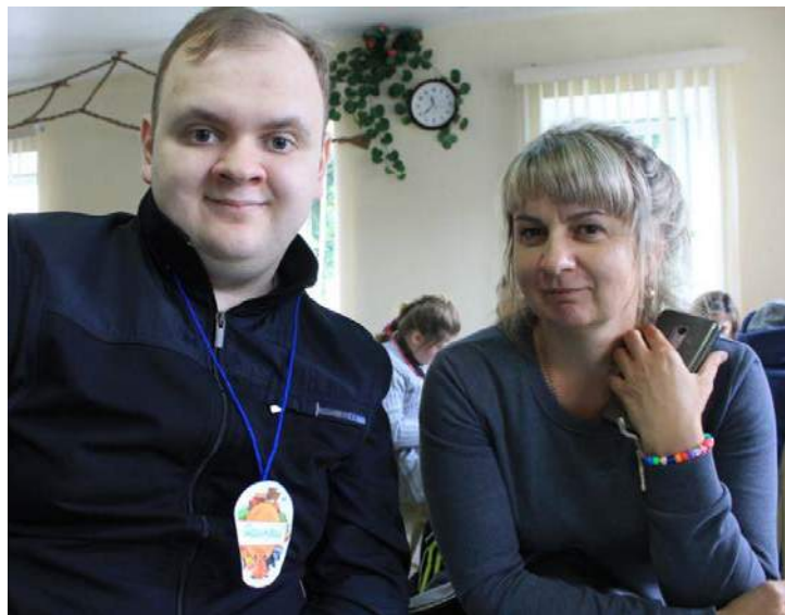
The children who attend the camp have a variety of physical and mental disabilities.

This past July was a joyful, unforgettable time for our church, and especially for 48 children, their friends, and parents. The children have a variety of physical challenges, and we had the joy of holding Camp Vozrozhdenie (Revival) in western Belarus.