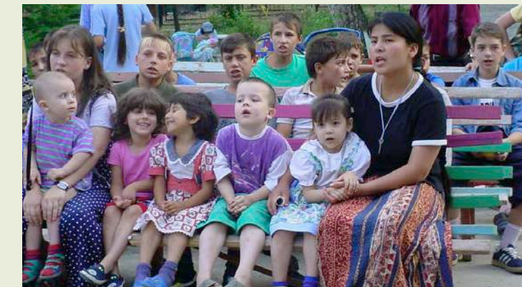
The camp for orphans ministers to both the children and their caregivers.

We are so thankful to SGA partners for your prayers and assistance in preparations to hold our camp for orphans . Ongoing bad weather forced us to postpone the camp until August 4 - 11. Part of the activities scheduled include taking trips and going on hikes. Please pray that the Lord will touch the children and their caregivers, so that they will trust in Christ for forgiveness and experience the love of our Lord.