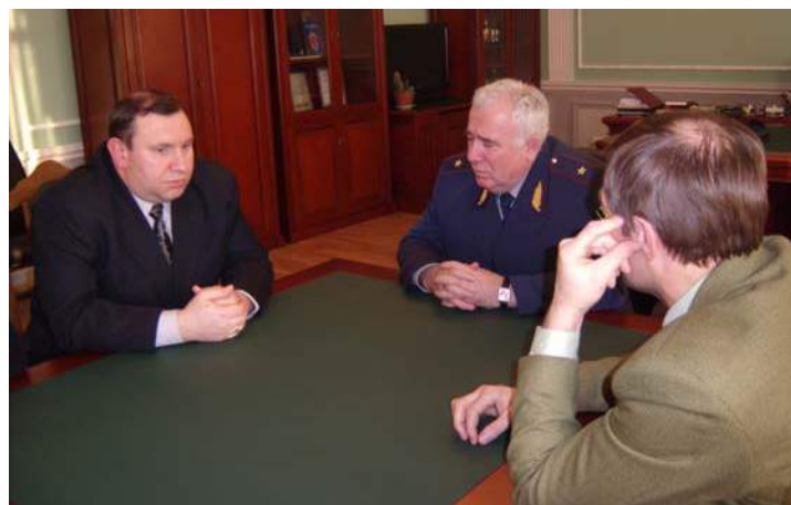
The general told of the exiled Baptist believers he had met years ago in Kolyma, Far East Russia.

Under the 70-year rule of atheistic communism, Christian believers endured severe persecution, with many giving their lives for their faith in the Lord Jesus. Many others were sent into internal exile in remote regions and lived in the most difficult conditions. When the older generation tells us of