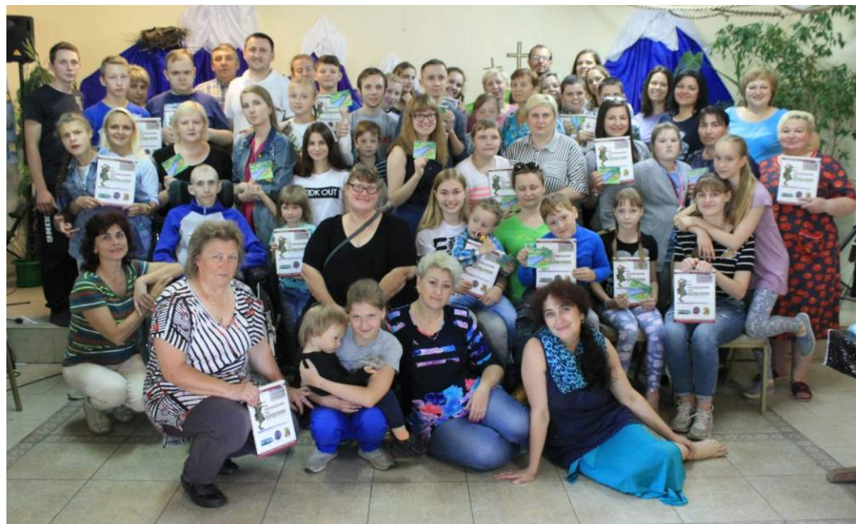
The children, parents, and staff all came together at the camp.