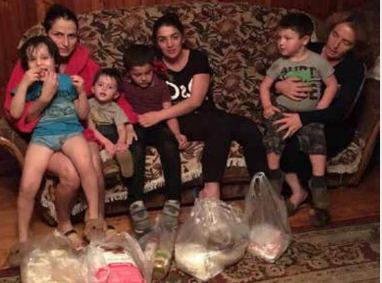
Children and families in Georgia, and throughout the Russian speaking lands, feel Christ's compassion through this ministry.