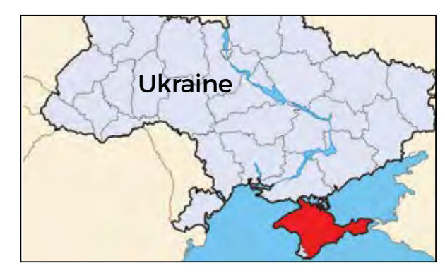
The Crimea region of Ukraine.

While this difficult situation does not directly affect the evangelical churches we serve across the former Soviet Union, increasing political tensions