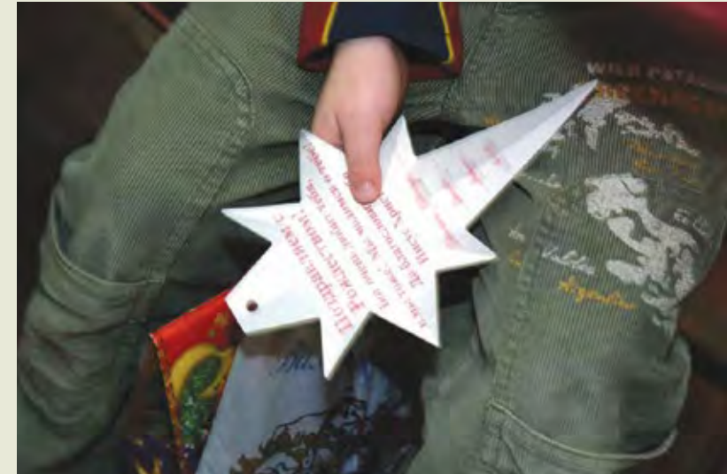
The children particularly appreciate the signed Bethlehem Stars.

Through Immanuel's Child and the year-round ministries of SGA, this dear couple and their church minister to these children who have been forgotten by the world, but not forgotten by God. We praise God for raising up faithful servants in Ukraine and the other CIS nations, and for all those who support