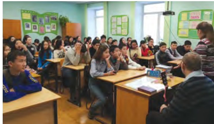
The students learned about Christ's love for them.