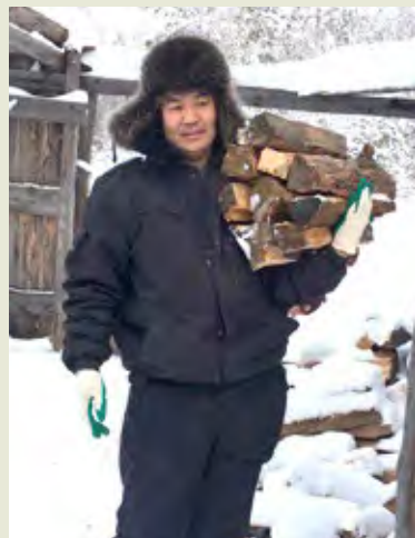
Helping local residents cutting firewood.