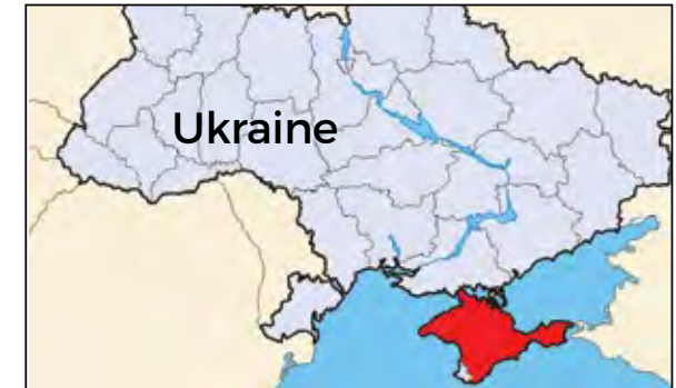
The Russian-annexed Crimea region of Ukraine.

As Crimea is effectively under Russian law now, these prosecutions are taking place using the 2016 "Yarovaya" anti-missionary law that has had