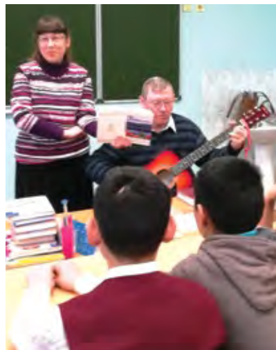
The children were eager to listen to the lesson and the songs.