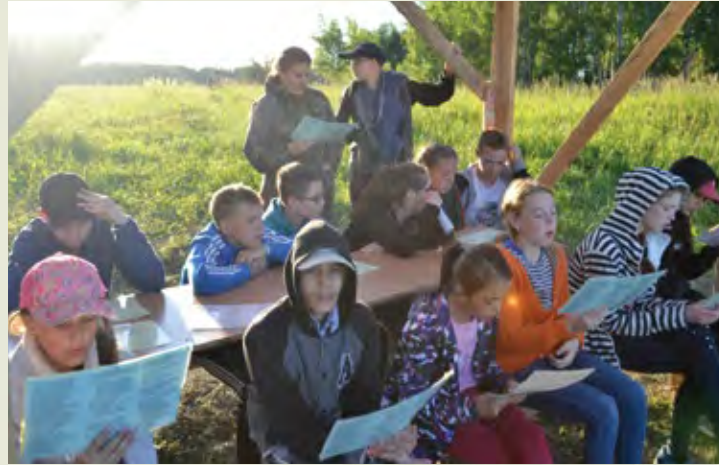
All of the children who attend the camp have "seeds" of the Gospel planted in their hearts.

“Camp always means joy for us. Two of my children went to the camp. This is the only place where I can send my children without fear and worry, as I am sure they will be looked after carefully. They will be taught good things. They experience and witness humility, peace, and a broader outlook in the camp. The children change for the better. I am happy about it