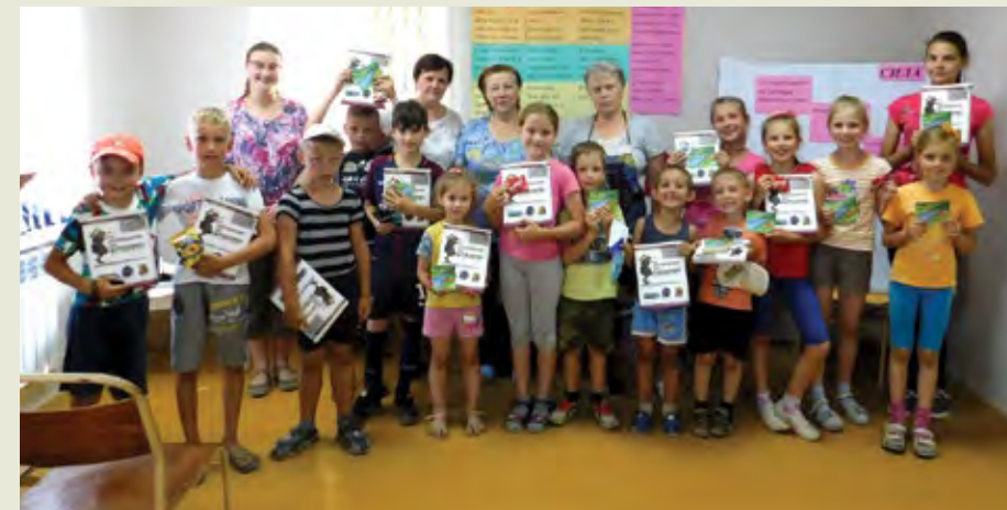
The children enjoyed the Vacation Bible School.

The VBS was held for five days. It rained at first, but we prayed and God answered our prayers with good weather during the rest of our time. We had 28 children take part including five new children. Our program consisted of songs, prayers, learning Bible “Gold Verses,” worship, fellowship, and crafts. As we worked with wood at one craft session, I shared the Bible story of how Jesus calmed the storm.