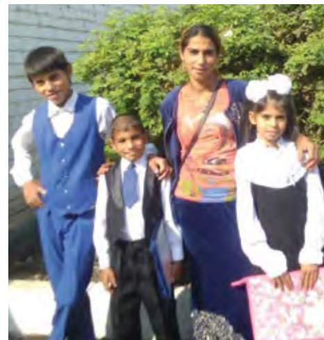
The man's family is grateful for the opportunity to know the Lord.