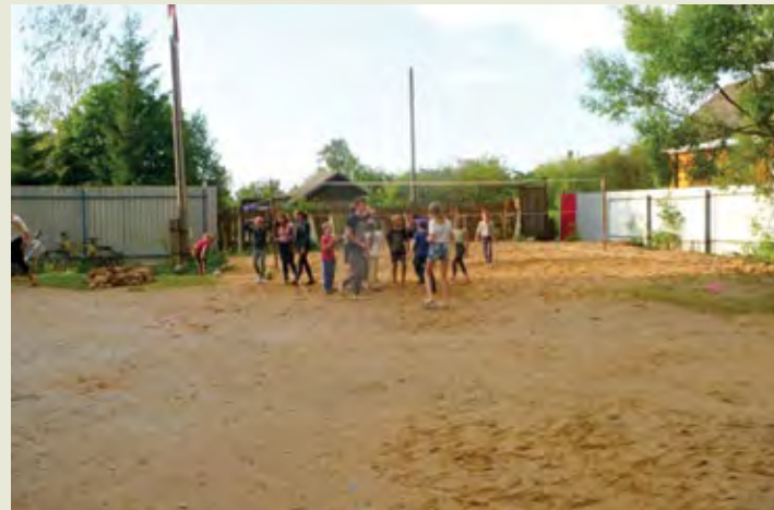
The children at the camp played on the sand field.

This summer, we had 60 persons participate in a Christian camp. Adults and children from the Sunday school and from needy families were involved. We organized a canteen on the ground floor of my new home. We cleared a place by the house and covered it with sand. Now we have a place for volleyball and the young people can come together for fellowship.