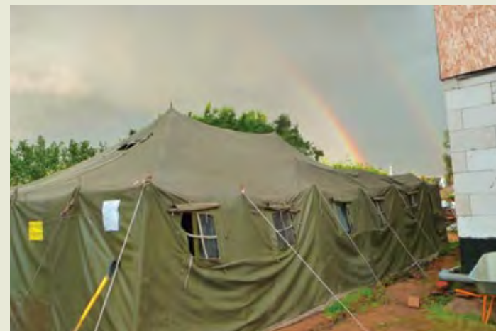
A beautiful rainbow over the campers' tent.