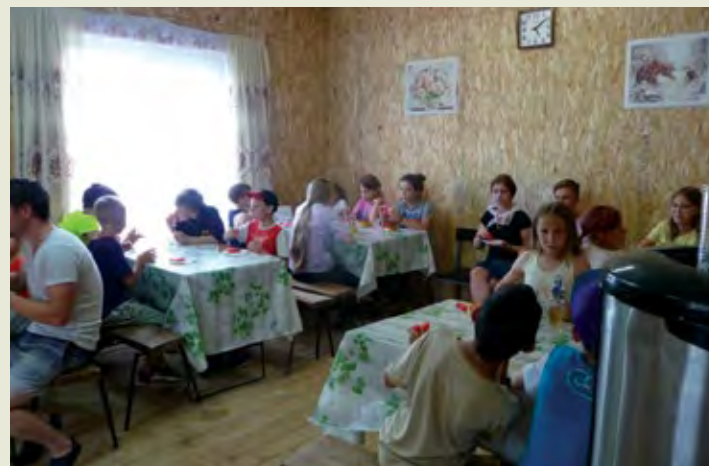
Everyone was able to eat together in the canteen.