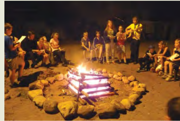
Everyone enjoyed singing by the campfire.

We built a campfire pit in the yard. We sat around it and sang songs. When the seven-day camp ended, the young people continued to come together by the campfire to study the Bible. We sang songs, played guitar, and discussed different topics. I cooked dinner for them in the camp canteen. We continued these activities for two months until the weather became too cold. Now the young people come together in my house for fellowship every Wednesday and Friday.