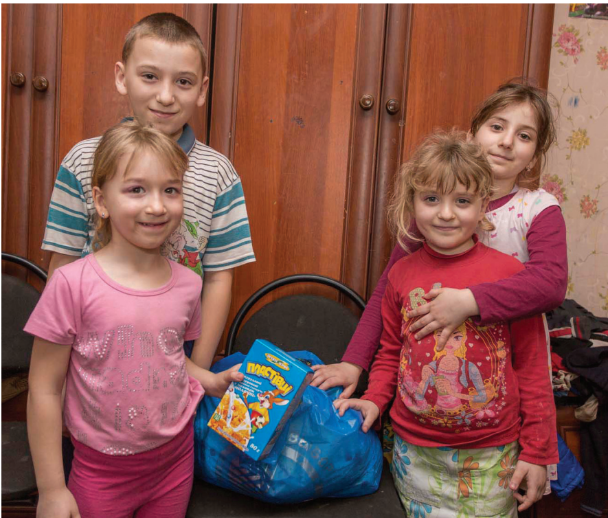
SGA’s Compassion Ministry helps support children and families throughout the nations of the former Soviet Union.