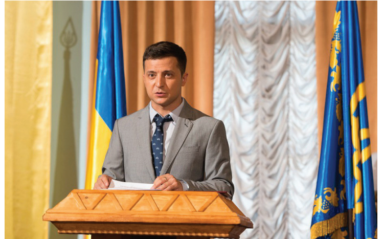
Volodymyr Zelensky, who once played the role of president on television, will now take the office in real life.

for the Gospel would continue for evangelical churches regardless of changes in government. ♦