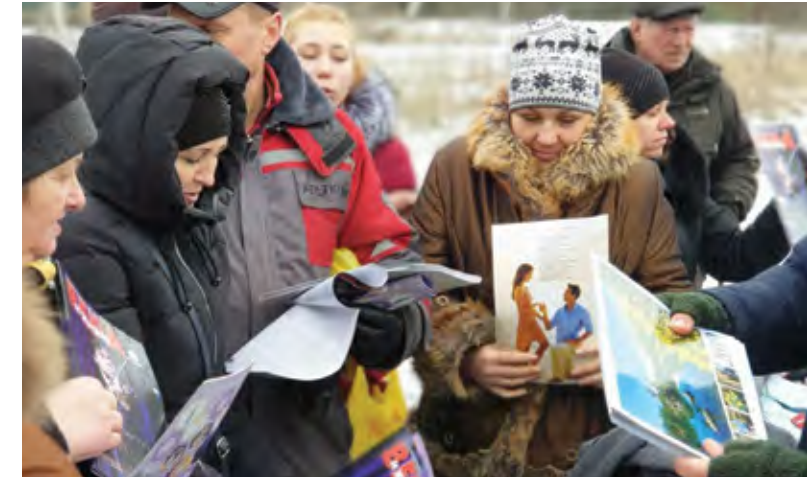
In addition to food assistance, Compassion Ministry distributes Christian literature to those in need.

than 140 homes are beyond repair, while 600 are repairable. Those who could evacuate to other cities have done so. Most of the non-displaced population are mostly older people over 60, as well as people with disabilities or no family elsewhere . . . We are thankful for your continued financial support of Compassion Ministry in Ukraine!