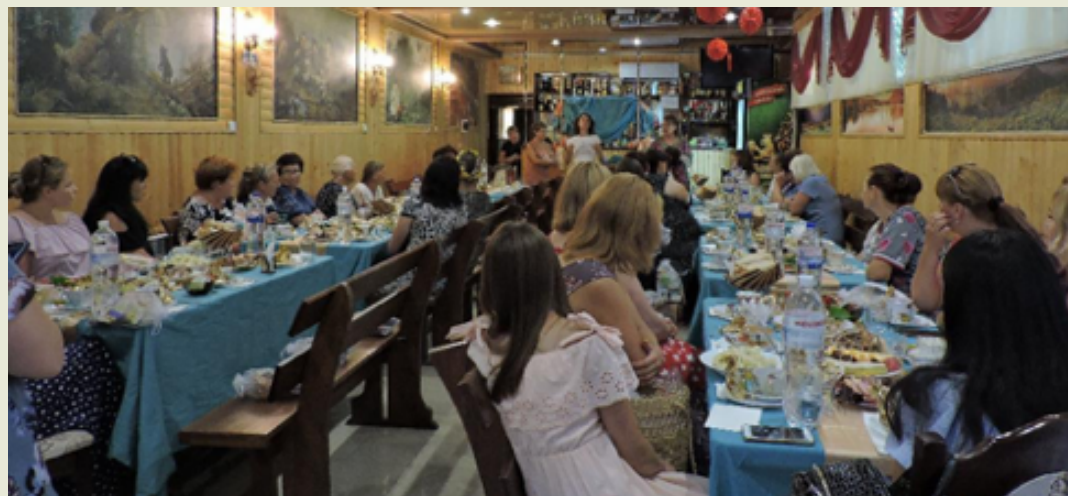
Women's meeting at a local cafe.

I thank you very much for the opportunities you help give me to serve, and to help others while preaching the Gospel. We love you! ♦