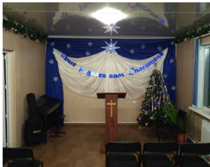
A Far East Russian church decorated for Christmas.

In fact, a woman from one village called and informed the brothers that a church had begun there