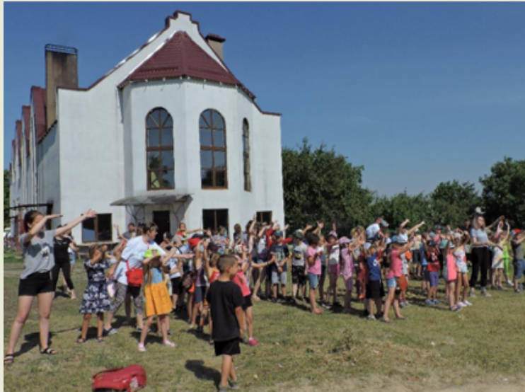
Children's camp in the war zone in eastern Ukraine.