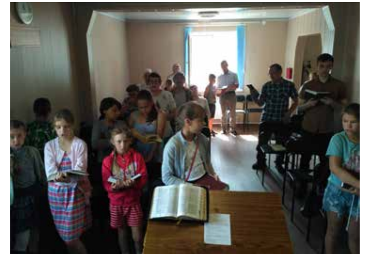
A congregation singing during a church service.

finally came to meet them last month. Then last Sunday, the parents allowed Dasha to take the bus