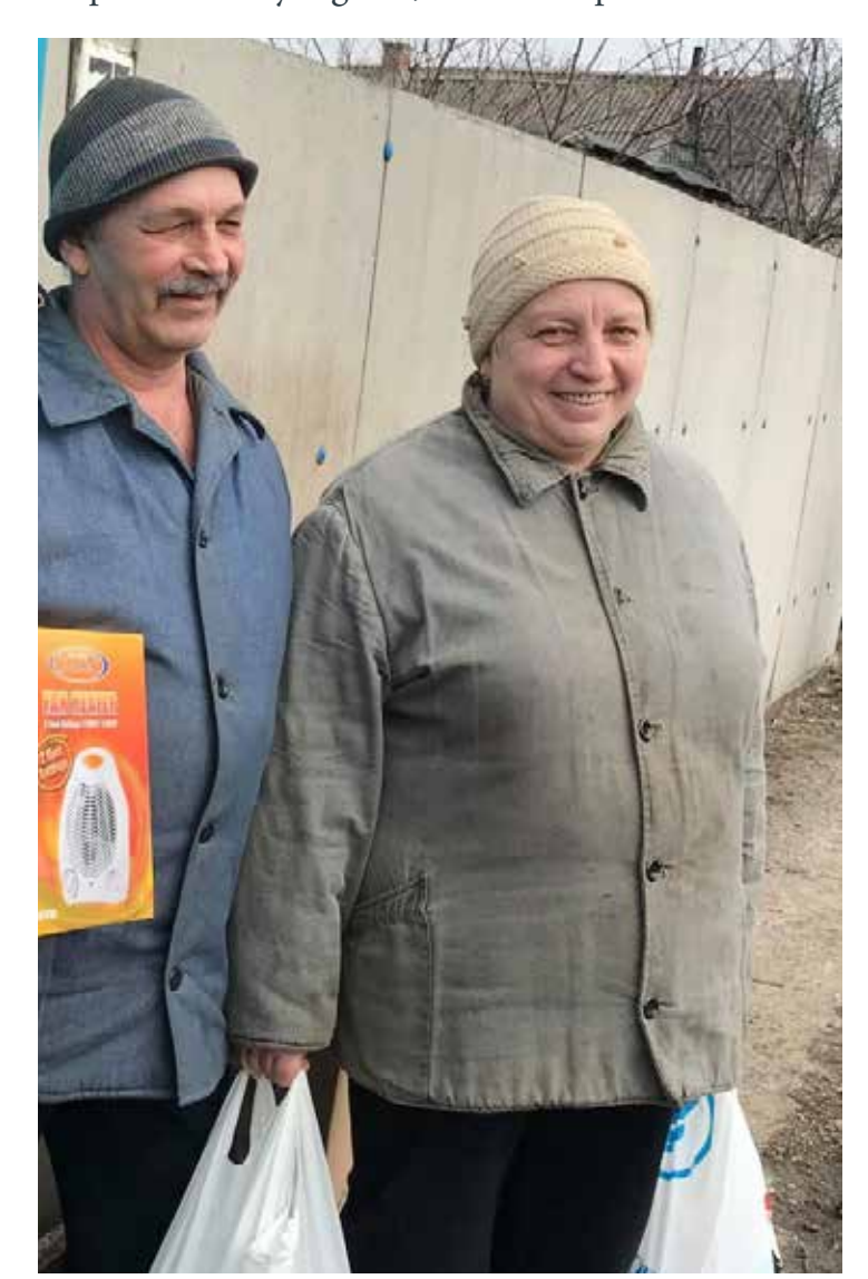
A couple is excited to receive relief packages in Avdeevka.

As winter's icy grip tightens across the former Soviet countries, thousands of needy individuals and families face serious difficulties. Poverty is rampant in many regions, and SGA-sponsored