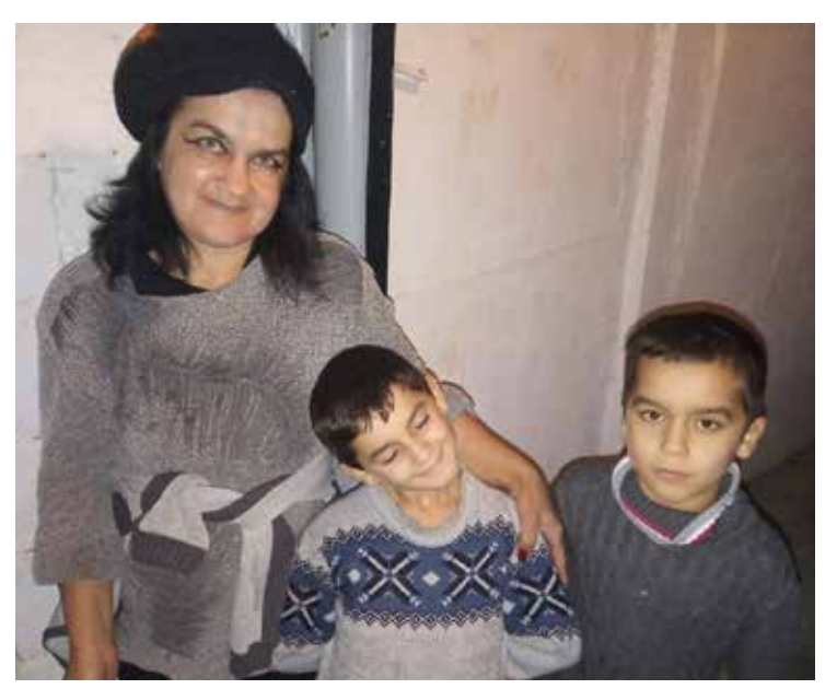
(Above and Right) Widows and their children are helped with food packages and medicine.

In the Caucasus nation of Azerbaijan, evangelical churches are under significant pressure and we must be careful in reporting to protect their security. Even