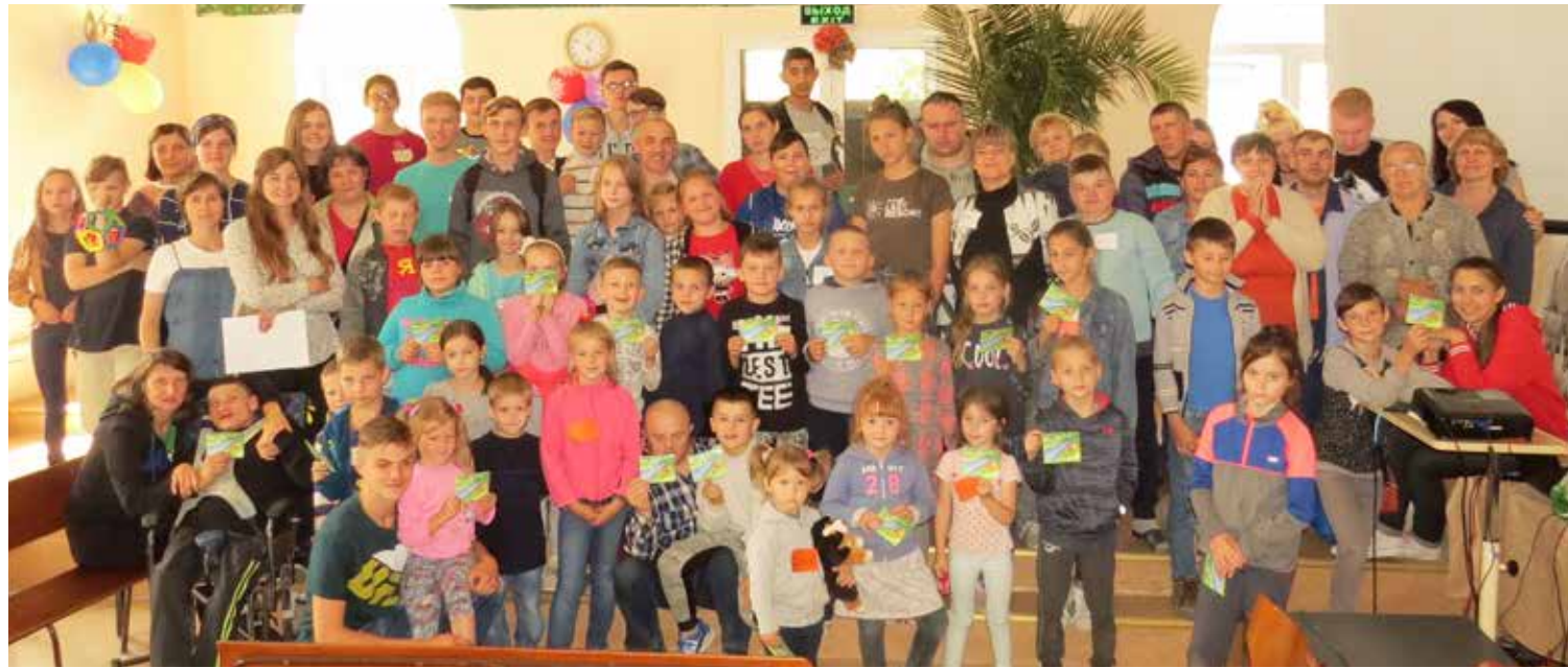
Group photo at the summer camp.