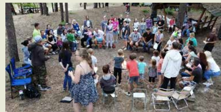
(Top) Prayer breakfast. (Above) Family camp in the forest.

It was a busy summer for ministry. We conducted children’s