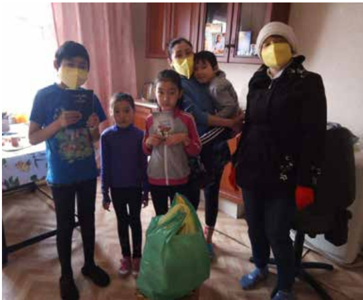
Families in Yakutsk receiving packages of food.

SGA-Sponsored Missionary Pastor in Yakutsk, Russia