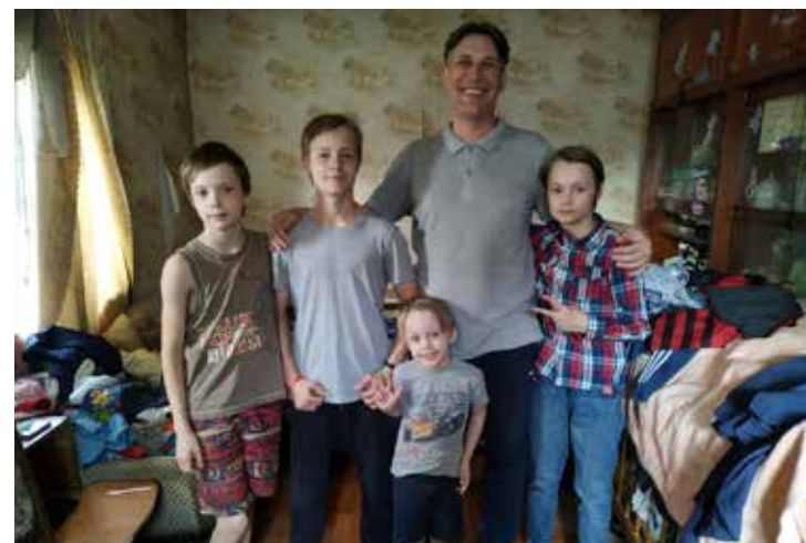
A missionary pastor in Omsk visits a family with four boys.

Tragic events such as the COVID-19 pandemic can be hard to understand as we see the human toll they take. Yet since SGA began the Christ Over COVID prayer campaign and related food distributions to afflicted families, we have seen example after example of how God is at work through His people in the midst of the sorrow. Lives are being changed and souls are being saved as the love and compassion of Christ are on display, and you have been a vital part of it all through your prayers and generous support. As we ended our fiscal year at the end of June, you helped SGA-sponsored missionary pastors and church workers distribute grocery parcels across Russia and her neighboring countries. These food parcels helped provide the equivalent of 1.5 million meals! And as we have shared in our daily email prayer updates that went out to those who subscribed, these food distributions helped open up many opportunities