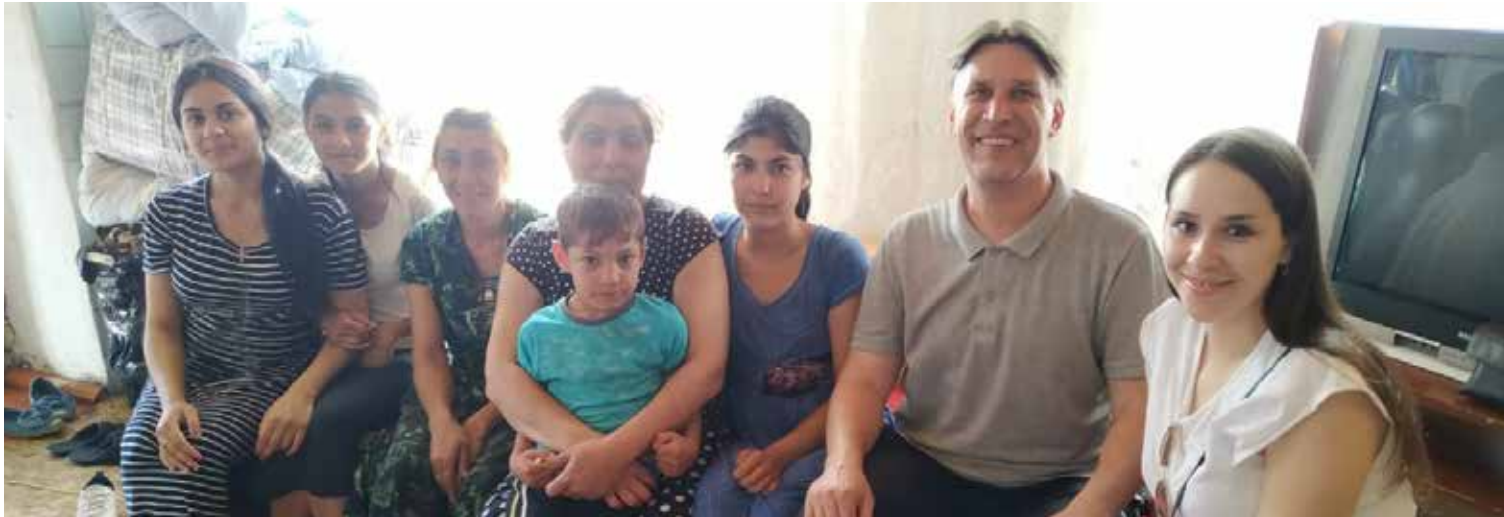
Five Roma families received food packages from the church in Omsk.

Compassion and the Gospel of Christ transform souls in Siberia . . . and beyond!