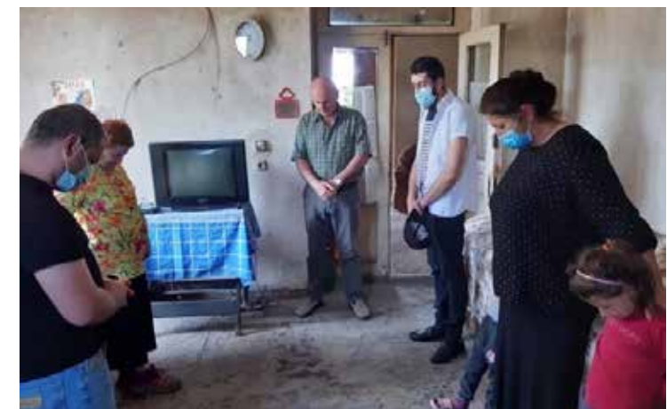
Delivering aid to families in Georgia.

In fact, some time earlier, our prayers for several unbelieving families were answered by the Lord and they will probably share about their blessings with others. Everything that was done could not have been accomplished without your help. Thank you so much! May the Lord reward you in His timing for all the goodness that you render to poor and less privileged families in a mutual effort with us! ♦