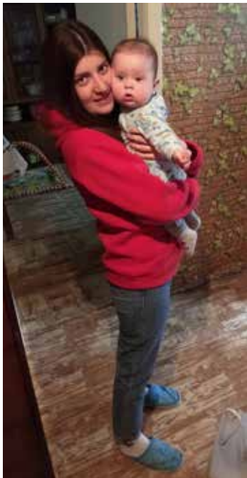
The girl and her baby.

Now, she has returned with her child and her mother to our city and, knowing of their modest situation, we immediately visited them with a packet of food.