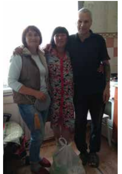
Bringing aid to a needy couple.

Other evangelical churches in the Omsk region say people are being drawn to the church through these encounters. As the pandemic wanes, please pray with us that the Gospel seeds being planted will take root and grow, with many coming to saving faith in Christ. And thank you for your part in supporting the Christ Over COVID outreaches! ♦