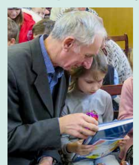
A grandfather and granddaughter look at a children's Bible the young girl received.

Across Russia and her neighboring countries, our brothers and sisters continue to minister and serve in the midst of incredibly challenging conditions. The COVID-19 pandemic is hitting their nations very