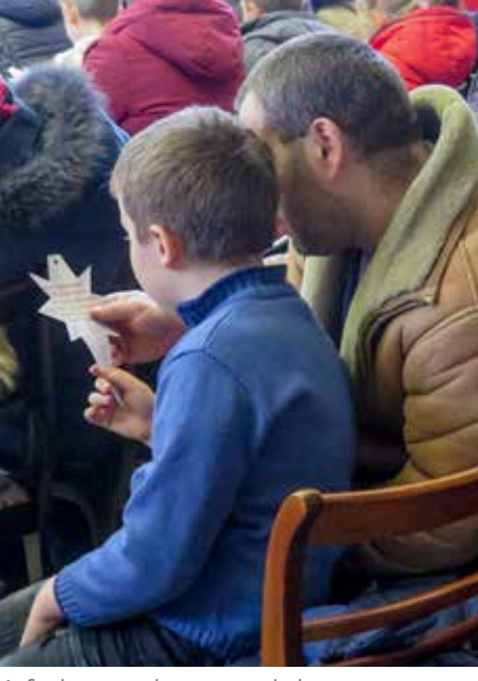
A father and son read the name or an Immanuel's Child star.

churches and children's workers. continue to bear fruit all year long. While the COVID-19 pandemic continues to impact lives across Russia and her neighboring countries, the churches plan to push forward, reaching more children than ever we are asking God for 50,000! But the new interest in