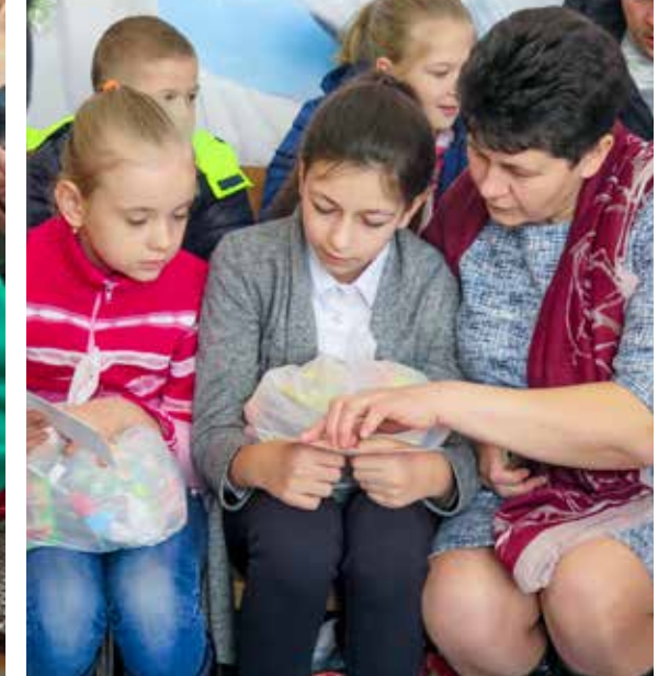
Children at SGA-sponsored Christmas outreaches in the former Soviet Union.