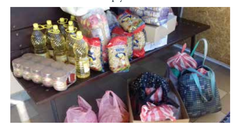
Preparing aid packages for needy families.

In the six years that have gone by since the war broke out in eastern Ukraine, thousands of people have joined in prayer and in giving to help provide urgently needed food and other aid to devastated families. We are also deeply thankful for the