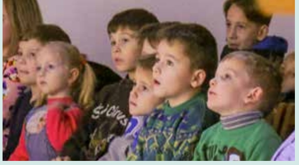
Children watch a play during an Immanuel's Child Christmas outreach in Belarus.

hard, and they have had to adjust their normal ministry operations—as we have—in the face of quarantines,