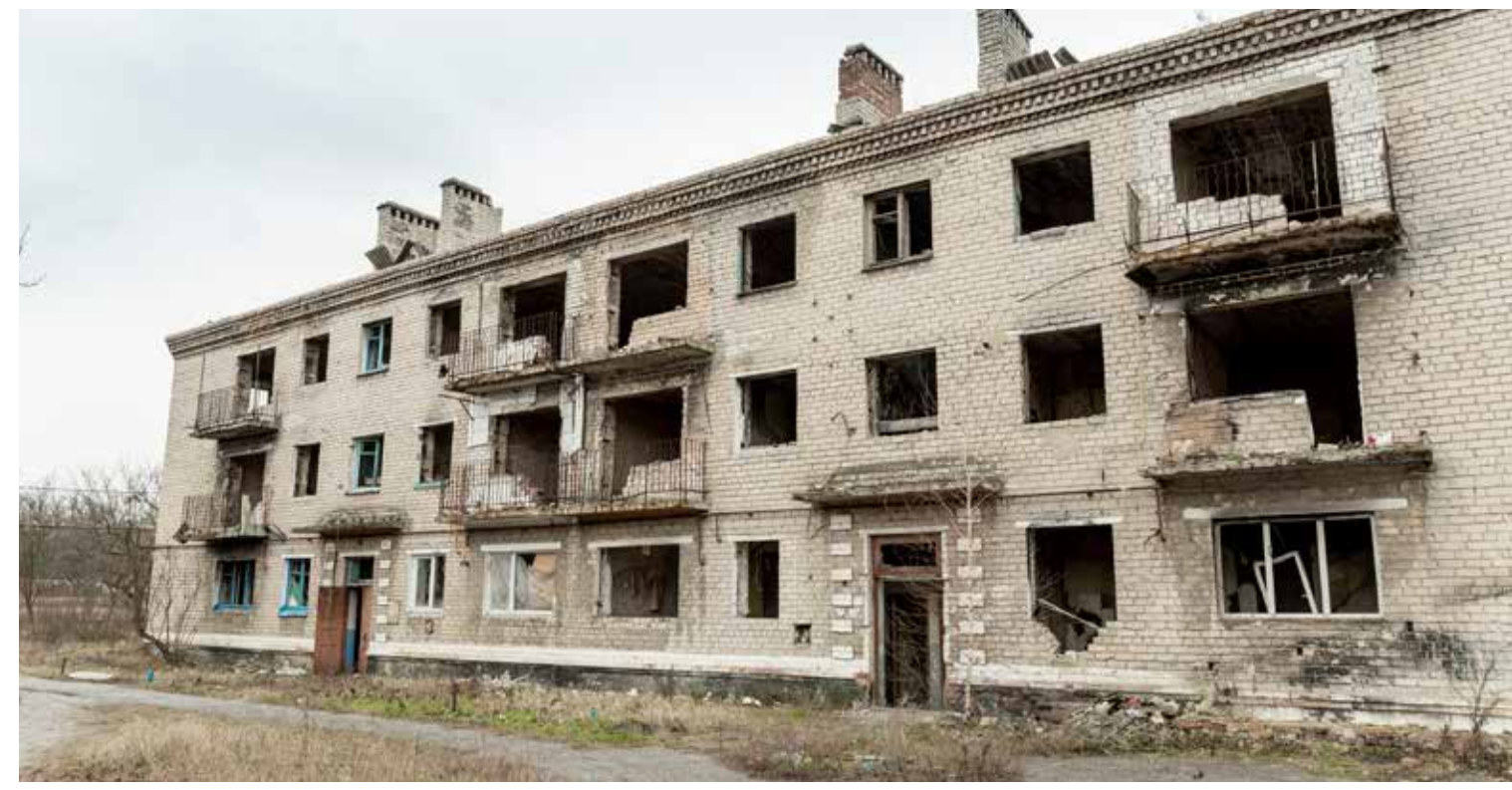
The ongoing fighting has uprooted many families. Apartment buildings and businesses have been completely destroyed.

... that we may be fellow workers with the truth (3 John 8).