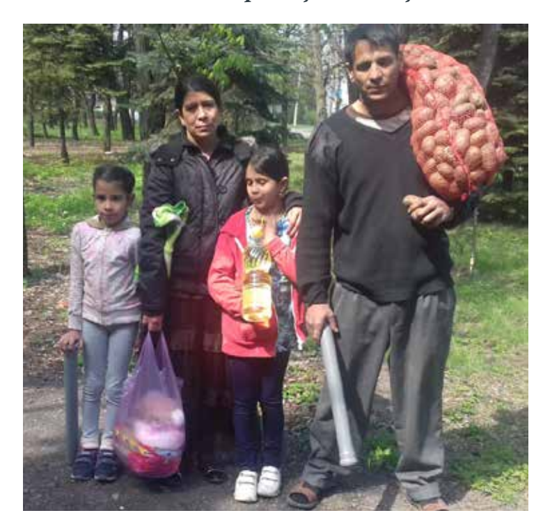
Many families are struggling due to the ongoing war.

fire. In one area, the village gathered at the church including widows and young women with children. Empty churches are filling, and these people would not have heard the Gospel any other way."