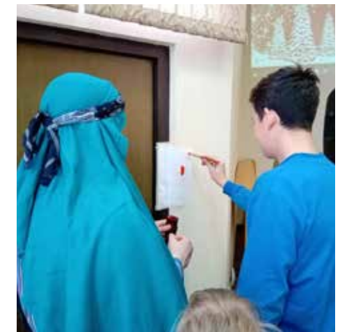
Learning about the Exodus of Israel and the Resurrection of Christ.

This is what we do, and we are very thankful that you participate in this ministry with us. May the Lord reward you abundantly for your kind hearts and bless you in all that you do! ♦