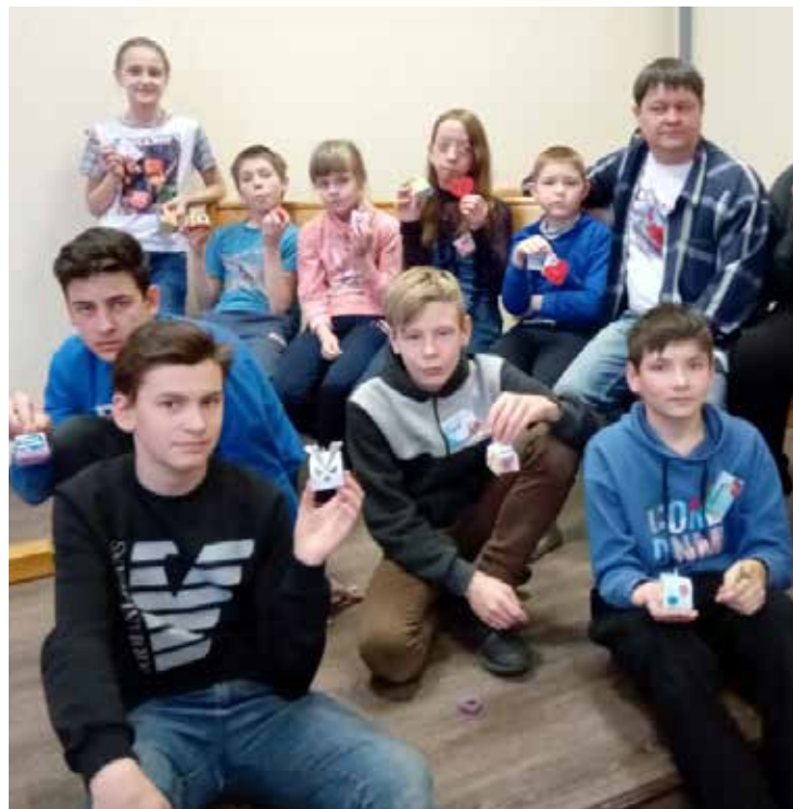
“Superbook” Bible club.

The Bible course for the children includes cartoons based on Bible topics, along with Bible study, games, singing, and pondering the meaning of God’s Word in our lives. Believers in our church are bathing these