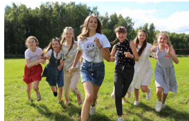
Campers spending time outside after being quarantined in their homes.

During these challenging days, the Lord has given us the opportunity to serve Him and minister to the children of our country through the Little Pearl Diagnostic Camp . The 135 children who came in the first session in July had already been quarantined in their homes because of the COVID-19 pandemic. These special days—made possible with your prayers and support—gave these children ten memorable days in the open air—a loving island of summer joy, happiness, care, and the hope of the Gospel!