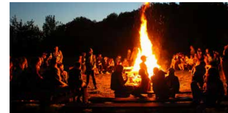
Enjoying fellowship around the campfire.

We thank the Lord for this opportunity and for His protection, and for you—our brothers and sisters who prayed for us and supported our camp ministry. ♦