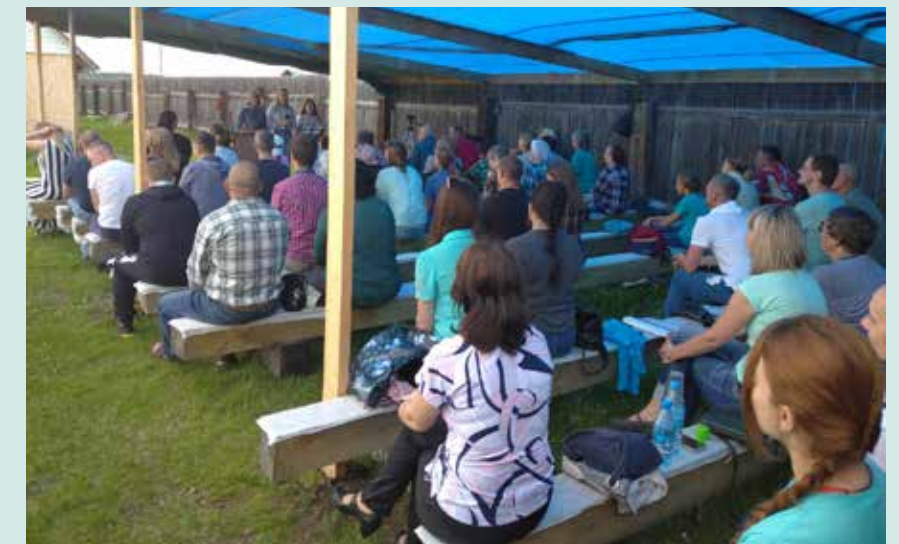
Holding a church service under a tent.

Please consider how you can help today! ♦