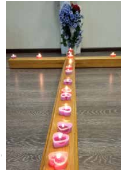
(Right & Bottom) “CROSS” children’s meeting.

meetings in prayer for each child and the parents. We also held a separate meeting with the children called “CROSS,” where we taught on the death of Jesus Christ for the sins of His people. It was one of the most moving meetings we held, with children and adults being invited to pray and ask the Lord to forgive their sins. The children prayed, and some of them wept. The