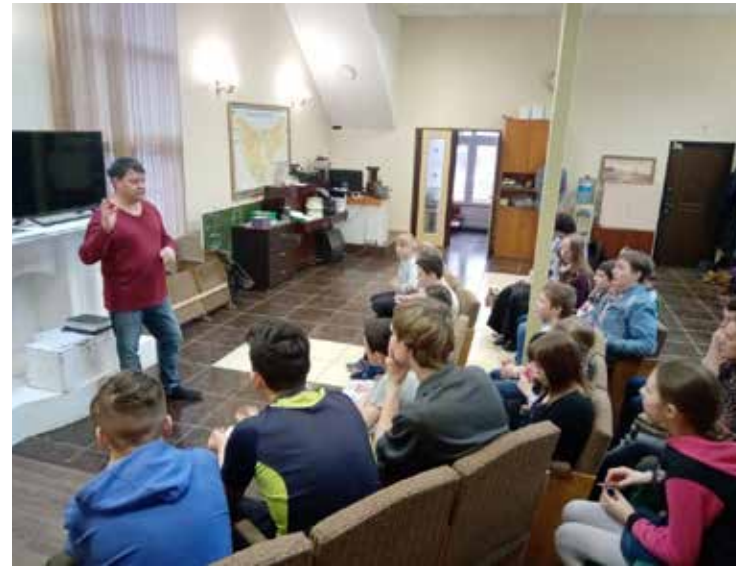
Studying the Word of God.

meetings in prayer for each child and the parents. We also held a separate meeting with the children called “CROSS,” where we taught on the death of Jesus Christ for the sins of His people. It was one of the most moving meetings we held, with children and adults being invited to pray and ask the Lord to forgive their sins. The children prayed, and some of them wept. The