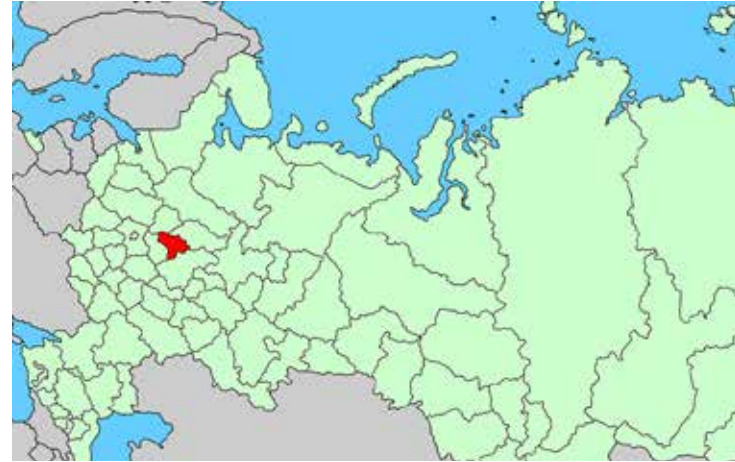
Kineshma is a town in the northern part of the Ivanovo Oblast of Russia.

“Many new children joined us and are now gladly visiting our “Superbook” Bible club. Adults and the children’s parents are also attending the meetings, and they seem to like it.”