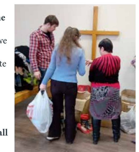
Giving clothing to families in need.