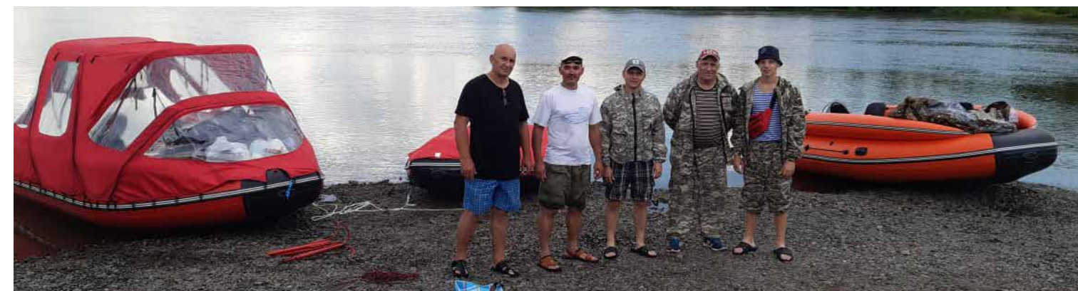
(Top) Visiting families on the river. (Above) Travelling by boat from village to village.

village of Orefievo, but we overlooked it on the river and went on for two hours. We almost ran out of fuel. Two fishermen told us we had passed Orefievo long ago