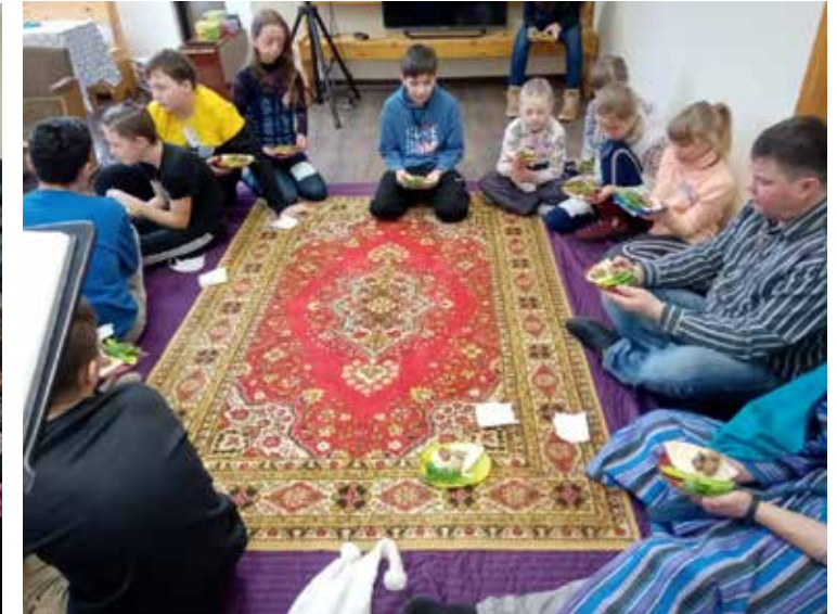
(Above & Right) Learning about the Exodus of Israel and the Resurrection of Christ.

second meeting was devoted to the resurrection of Christ, and then we taught on the Exodus from Egypt, and how it ties with what Christ has done for us. We give glory to the Lord for the way He is moving in their lives!