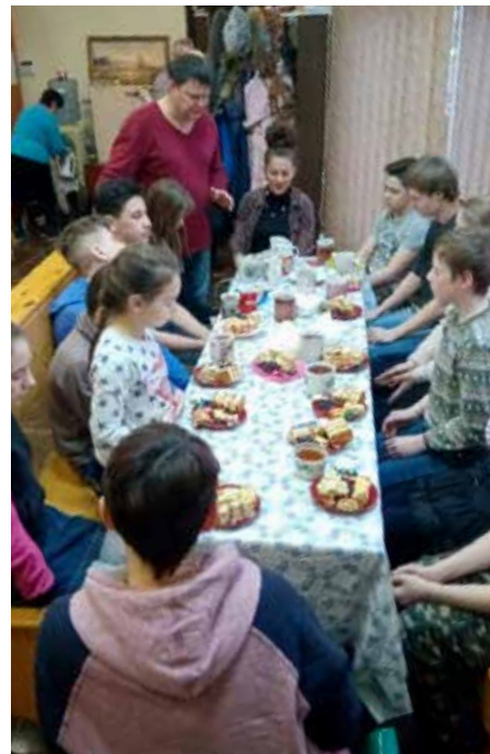
Snack time at a children’s meeting.