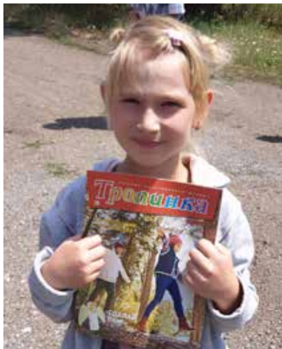
Bringing God's Word to children and their families.

The families were among those who had lost a source of subsistence, disadvantaged families and widows. Most of them have no family and are not even able to get to a grocery store. Your support has been especially helpful to families with children who are in the midst of the war zones.