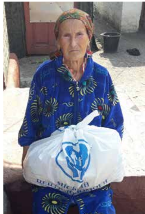
Delivering food packages to widows and needy families in the war zone of eastern Ukraine.