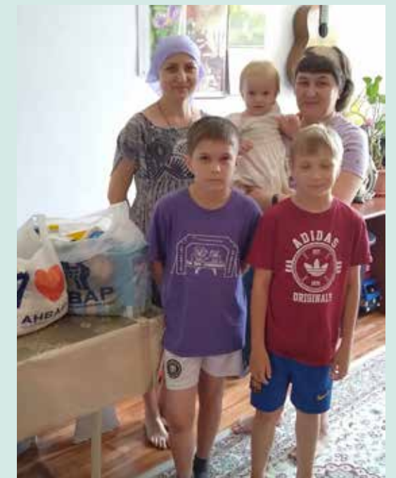
Delivering much-needed groceries to a family with a new baby.

Please pray about how you can help today in sustaining SGA's ongoing ministries! Please use the enclosed reply slip and return envelope to make a gift as God leads. ♦