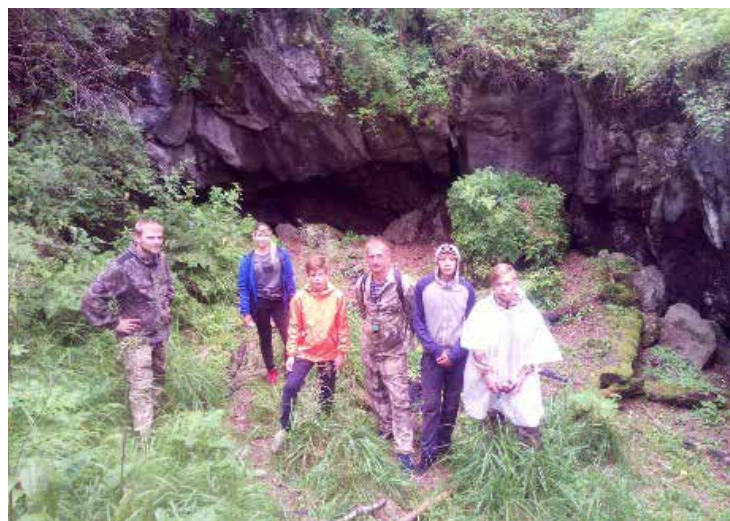
Top and Above: Walking trip with children.

and careers, we often lose God's blessings and even our souls. There were different children on our trip, some heard about God for the first time, while others had to re-evaluate their priorities.