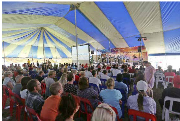
Session at the church retreat.