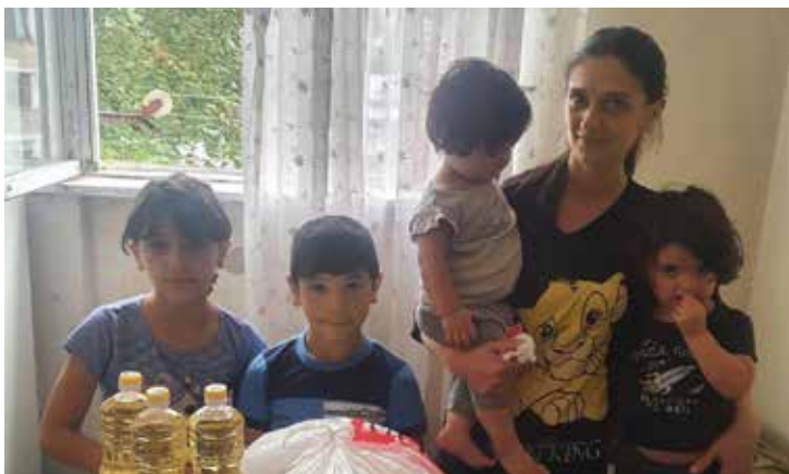
Bringing food packs to a family that moved from Nagorno-Karabakh to Armenia.

“On the Armenian side, refugees have attempted to return home as winter set in. They returned to find their homes destroyed or occupied. There is much anger and pain right now. Some of the aid