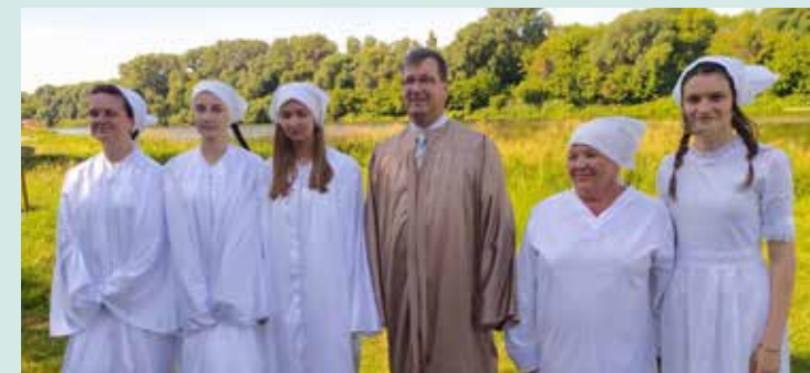
At the baptism service.

One of our sisters in the Usman church gave her unfinished house to the church as a gift. There are several Christian families in the village, and we held the first worship service with them in July. We prayed, asking the Lord to bless the construction that would now take place, and He did! We began cutting grass and cleaning up garbage. We also invited local believers to take part in fundraising for the church construction. Progress has been made and Bible studies are now being held there. We also held a baptism service, with eight people publicly declaring their faith in Christ and a celebration afterward.