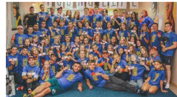
Top and Above: Teenage camp in Novokuznetsk.

Due to quarantine many events were cancelled, but the work that the Lord entrusted to us could not be either stopped or cancelled. Thank you for your support and prayers! ♦