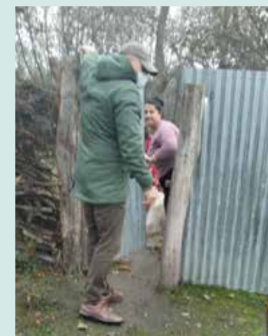
Delivering aid to an Azeri family.

It is a new year, and its arrival brings many new needs and ministry opportunities for the evangelical churches SGA serves across the former Soviet Union. Whether it is food aid for needy families impacted by the COVID-19 pandemic, help for war refugees in the Nagorno-Karabakh region or eastern Ukraine, or meeting individuals and families in regions where the Gospel has never been preached, your faithful support continues to have eternal impact. You are helping to provide Russian-language Bibles and Christian literature, theological training for pastors and church workers, ministry to orphans and other needy children, resources for planting new churches, and so much more. Please pray about how you can help today! ♦