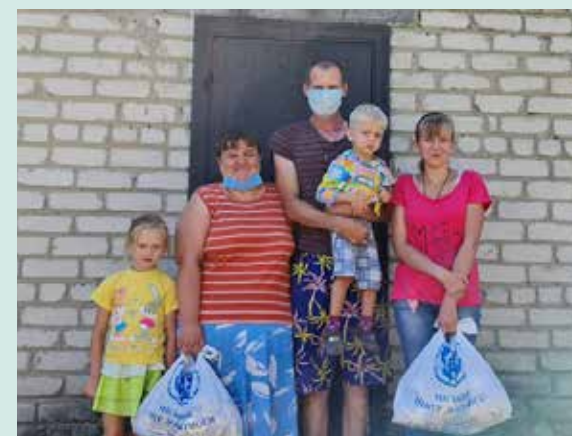
Bringing food packs to a family in the Ukraine war zone.

It is a new year, and its arrival brings many new needs and ministry opportunities for the evangelical churches SGA serves across the former Soviet Union. Whether it is food aid for needy families impacted by the COVID-19 pandemic, help for war refugees in the Nagorno-Karabakh region or eastern Ukraine, or meeting individuals and families in regions where the Gospel has never been preached, your faithful support continues to have eternal impact. You are helping to provide Russian-language Bibles and Christian literature, theological training for pastors and church workers, ministry to orphans and other needy children, resources for planting new churches, and so much more. Please pray about how you can help today! ♦