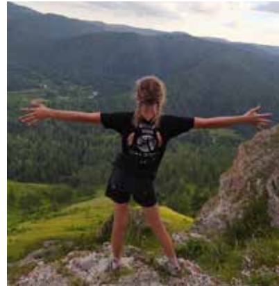
Exploring God's creation during the walking trip.

After that retreat, three of the youths stayed