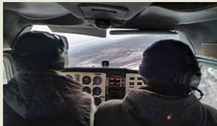
The first flight.

By the time we moved, missionary aviation had already become a reality in Far East Russia, and I supposed that I would smoothly blend into the work of the ministry and it would only continue to grow in its effectiveness. Contrary to my expectations, shortly before we arrived, the operation in our local region had stalled. The annual certification had lapsed on both aircrafts and we found ourselves in an uphill battle to get the airplanes back in the air. Shortly after our arrival, several significant changes were introduced into the federal aviation regulations. The changes affected the following areas: the classification of our aircraft, the engine and propeller time, and calendar limitations. In short, every part of the aircraft was affected by the changes of the new regulations. What made the new process even more difficult, was the confusion on how to implement these new requirements on the level of the local aviation authorities. Everyone was confused and it took time to