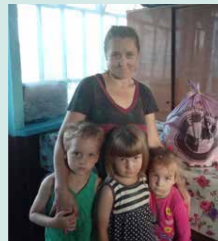
Compassion ministry in Ukraine.

How blessed is he who considers the poor; the Lord will deliver him in a day of trouble (Psalm 41:1).