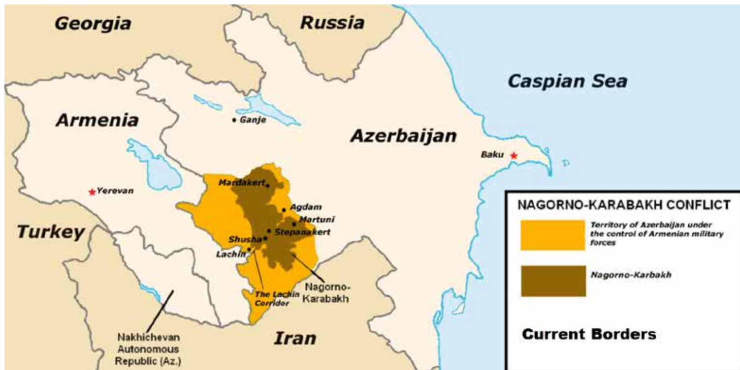
The disputed Nagorno-Karabakh region between Armenia and Azerbaijan.

the pandemic, and later the war refugees. The food packages also contained items such as shoes, blankets, and some medicines.