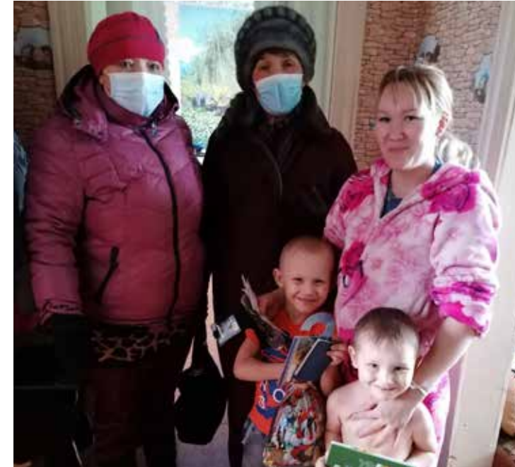
Delivering Immanuel's Child gifts in Bokhan.

Your gifts support new Immanuel's Child and family outreaches