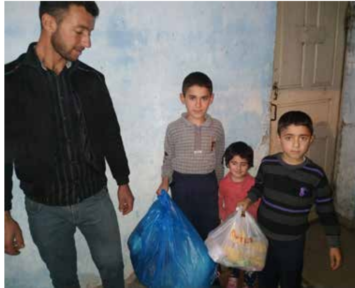
Delivering food packages to needy families.

When you add the COVID-19 pandemic into the equation, the need, heartbreak, and tragedy only increased. It is into this great sorrow that SGA partners helped evangelical churches in both countries step in to bring comfort, urgently needed humanitarian aid, and the hope of the Gospel. Between April 2020 and January 2021, evangelical churches distributed enough food to provide 77,263 meals to needy families impacted by