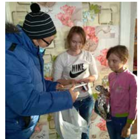
The children were delighted to receive the Christmas presents.

Thanks to SGA partners, our church engaged in preparing for Immanuel's Child in Bokhan. We purchased gifts, sweets, warm socks and gloves, and also included Christian books and the Star of Bethlehem ornament. We praised God for His provision, and it shows that even though we live in countries far from each other, we are near and close as one family united in His name!