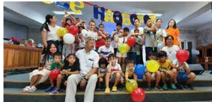
Children's camp at the church.

We could have given up, but we are God's