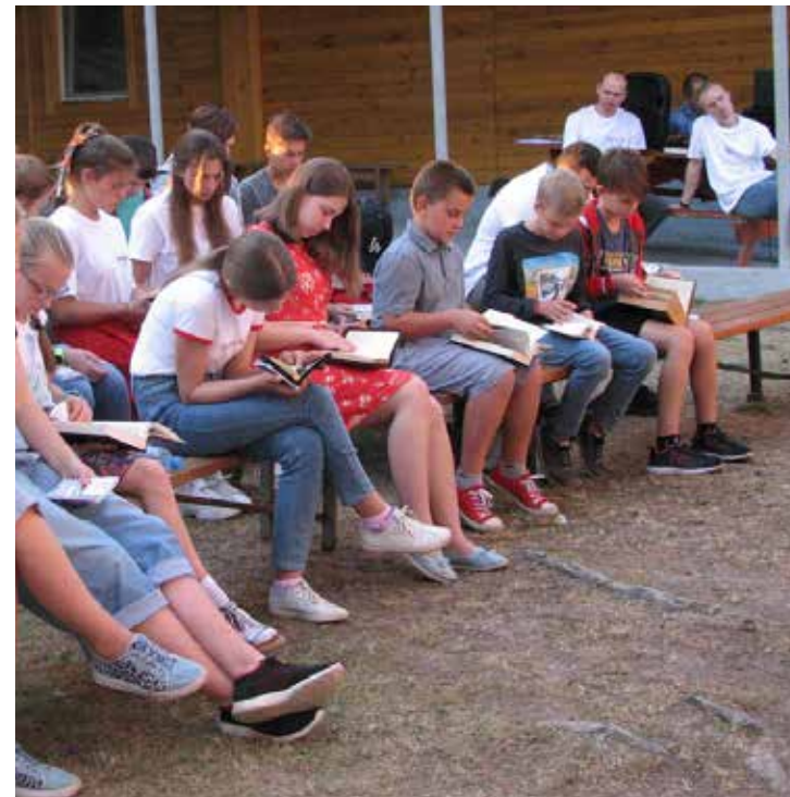
Top to Bottom: Meal time; camp counselors lead the children in a time of singing; studying God's Word during a Bible lesson.