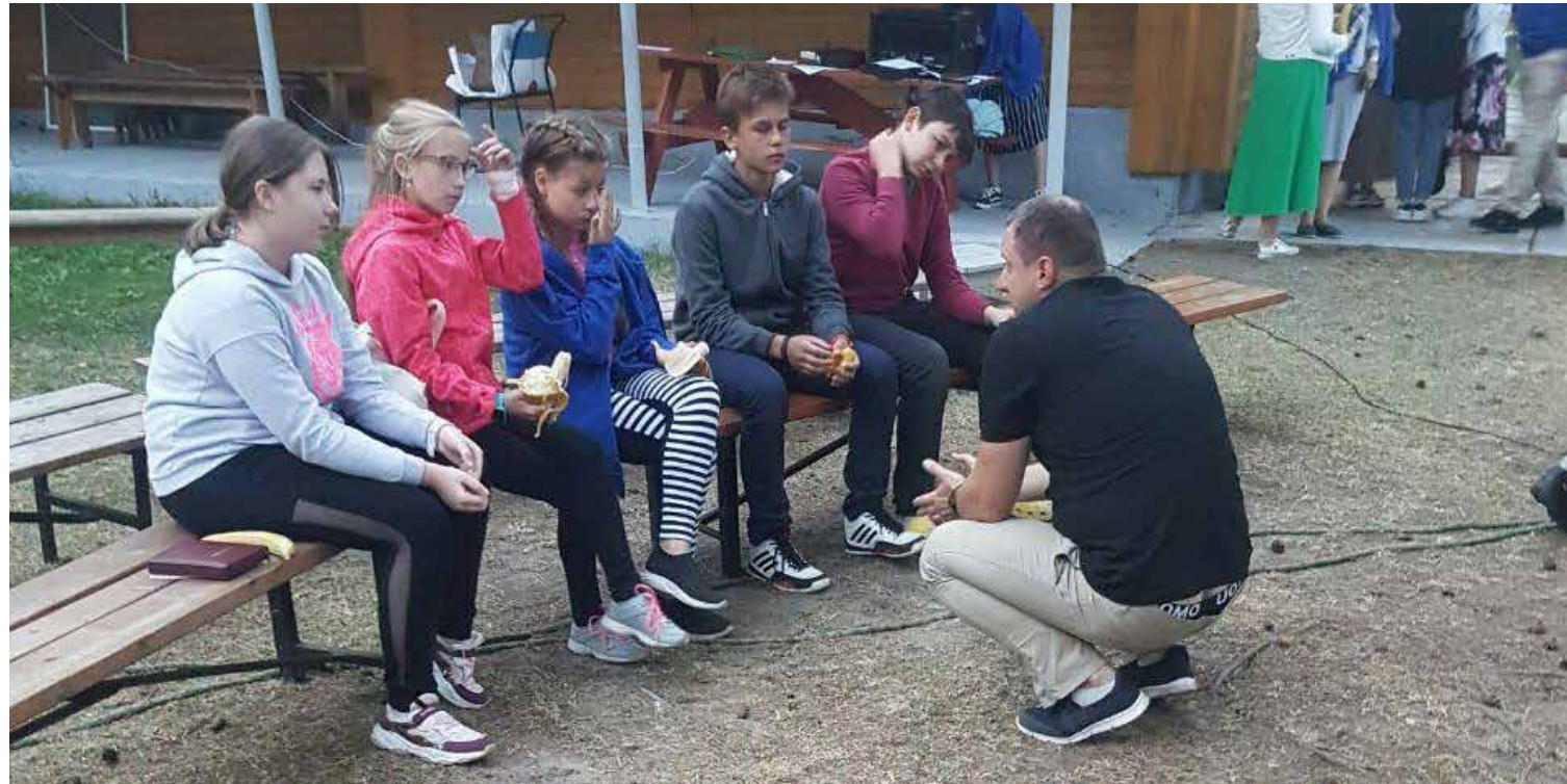
A camp leader talks with some of the children who repented and came to Christ.

G reetings dear friends! Looking back at the summer camp season held by Golgotha Baptist Church in Minsk , it was a special blessing for the children and the church team. We had to postpone the dates for the camp two times, but at the end of August, the camp finally took place.