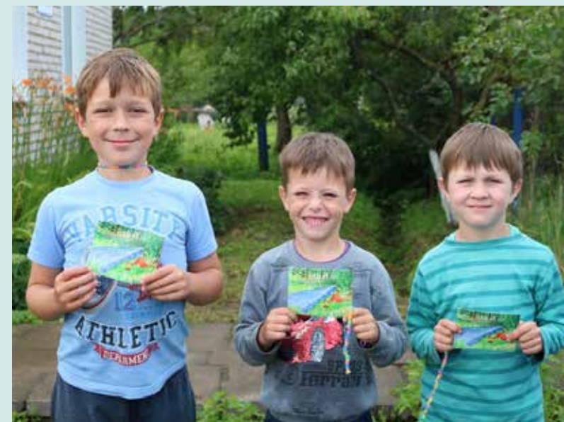
Children at a Belarussian summer camp hold welcome cards signed by SGA partners in America.

After such a long winter and the ongoing challenges of the COVID-19 pandemic, the thought of warm temperatures and summer can't help but brighten our outlook. The churches SGA serves across the former Soviet Union are already in the midst of planning their summer