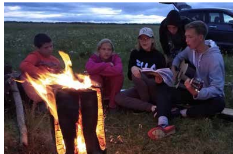
Fellowship around the campfire.

We also spent much time in helping needy families whose lives were made even harder by the pandemic. Many have been laid off of their jobs and