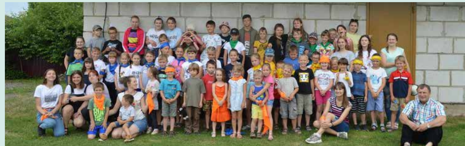
Summer camp in Belarus.

Please don't forget to pray regularly for these camps, asking the Lord for His gracious provision, protection of the children and camp workers, and above all, open hearts toward repentance and trusting in Christ as Lord and Savior! ♦