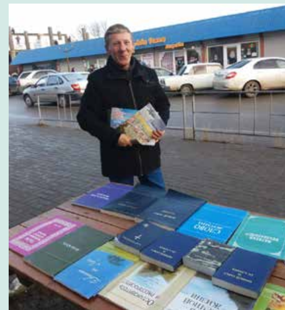
A former prisoner who came to Christ through prison ministry now helps distribute Christian literature as a witness to others about Jesus.

Day in and day out, faithful missionary pastors supported by SGA carry out their fruitful ministries across Russia and her neighboring countries. They shepherd their congregations, visit individuals and families in their communities with the Gospel, deliver food aid to needy families, and lead Bible studies, often in more than one town and multiple churches.