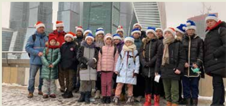
Trip to Moscow with the children.