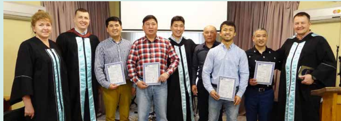
Students and teachers from Almaty Bible Institute.

One thing we have seen repeatedly is that solid Bible training and fruitful ministry go hand in hand. For many years now, SGA has had the great privilege of sponsoring Irpen Biblical Seminary in Ukraine, Minsk Theological Seminary in Belarus, Novosibirsk Biblical-Theological Seminary in Russia, and Almaty Bible Institute in Kazakhstan. These schools help train pastors and workers for advancing the Gospel in their home regions.