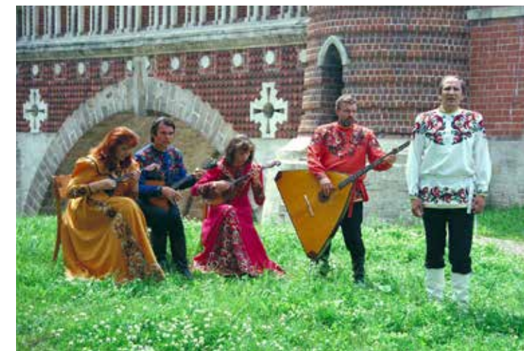
Blagovestie has performed around the world.

their extraordinary lives of service to Christ through the years. ♦