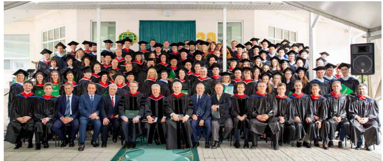
Graduation ceremony at Irpen Biblical Seminary in the spring of 2021.

On November 21, 1993, when I was 13 years