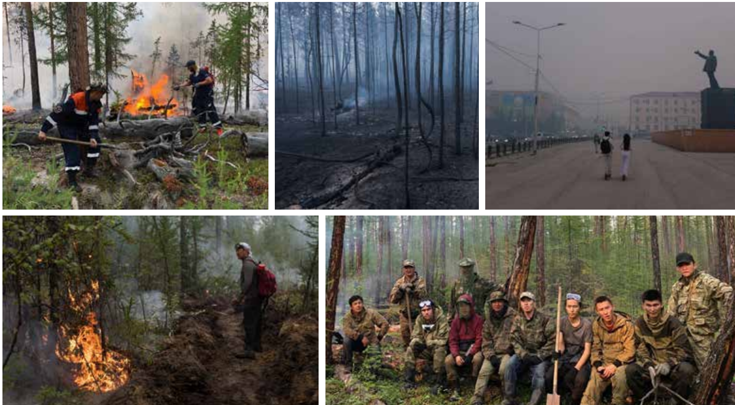
(Above) Firefighters and volunteers work together to fight fires in the Yakutia region. (Top Right) The lingering smoke and ash make it difficult for residents to breathe.

midst of these days, going on missionary trips. We went to the village of Pokrovsk to hold ministry, helping the local church and sharing the Gospel with non-believers. Meanwhile our Christian doctors team recently came back from a missionary trip to the village of Cherkekh. They helped locals with medical care and told them about salvation through Jesus Christ. Please pray for Yakutia and that the fires will stop. But most of all, pray that more souls will be saved during these hard times for our land. Let them hear the Good News about the resurrected Lord Jesus Christ and His salvation! ♦