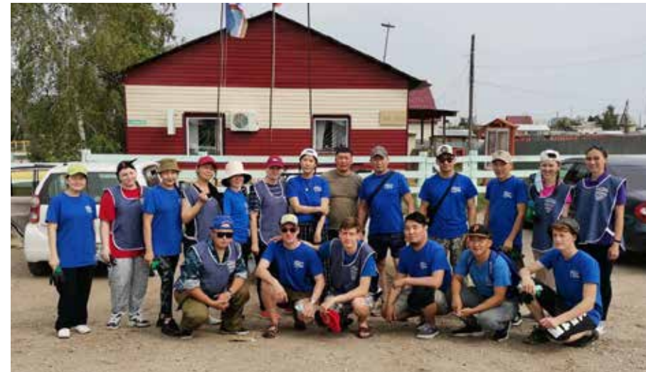
The youth team on a missionary trip.

We've had hundreds of forest fires in the Yakutia region. Fires are active on an area of more than 2 million acres. It's impossible to extinguish the fires by any means, so we have only hope for God's help. Towns and villages are in smoke, it's hard to breathe—it's bad especially for those who have health problems. Some of our brothers in outlying villages joined volunteer firefighting brigades in order to protect their homes from fire. Our churches pray for rain and