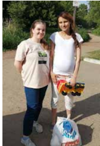
Providing aid for a young pregnant woman.

One mother came to us to help look after her children because her alcoholic husband was a real threat to them. Their daughter had previously been in a shelter because he physically abused her. The mother had been in a penal colony so she was unable to look after them on her own. We helped this family with all-around assistance, and now all the children have been reunited with their mother. More aid was provided to another pregnant young woman who has other children. It is a dramatic testimony—the father was recently released from prison and has had problems finding work, but both of them are now coming to the church! Pray with us that God's love will draw them to saving faith in Him!