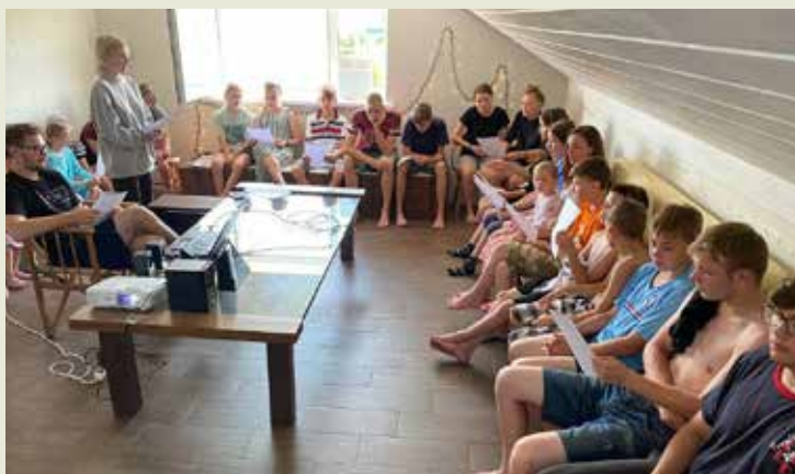
Studying the Bible together during the camp.

Please continue to pray, and to participate in our ministry! ♦