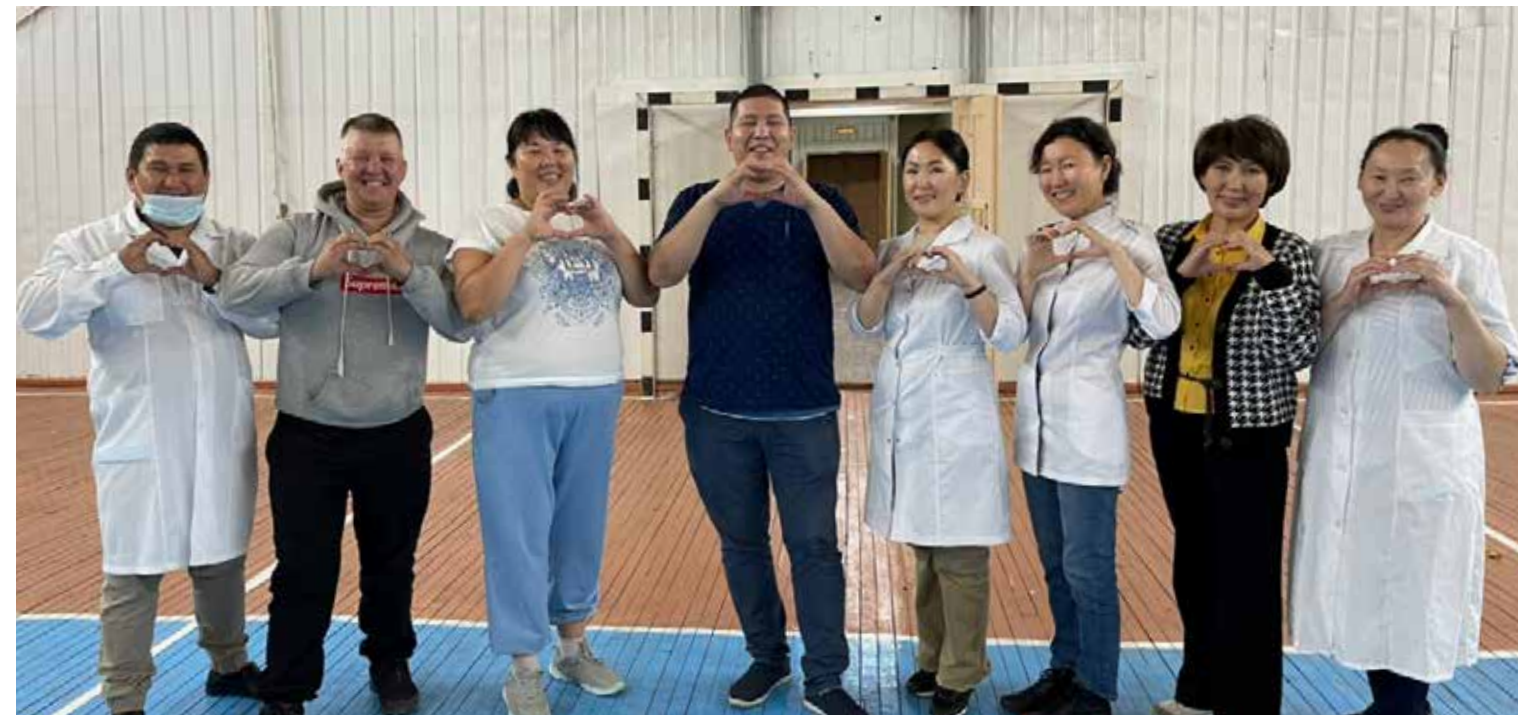
The Christian doctors team.