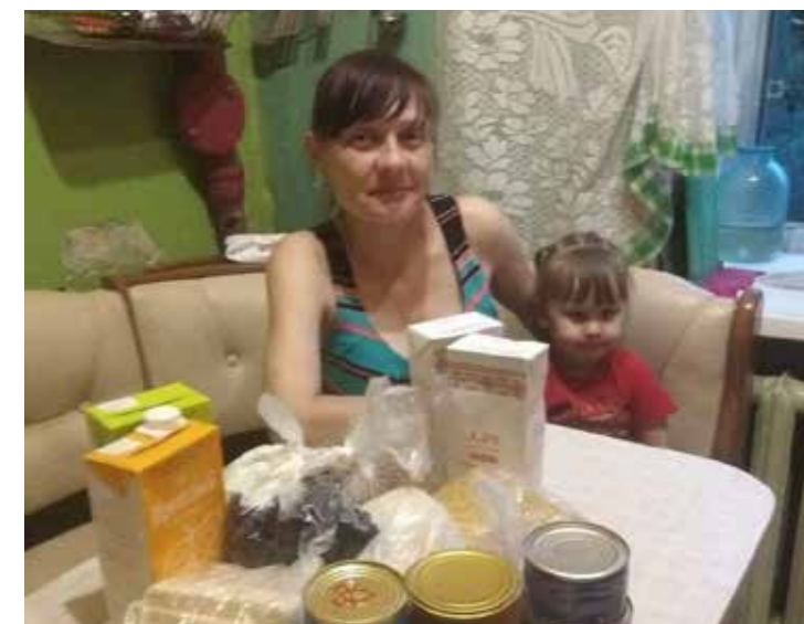
Bringing a grocery pack to a family in need.

One of the things we are doing is contracting for a "Crisis Apartment." Young mothers are being provided with some aid, and a plan developed to resolve difficult life situations. One person we have been working with is an orphanage graduate. She is a mother with many children and received our aid—food, clothing, some legal help, psychological assistance, and we are now ministering to this family. These outreaches have led to cooperation with other orphanages. We signed an agreement with Aftercare Services for Orphans, plus another orphanage administration expressed the desire to work with us. Little by little, the Lord is entrusting people to us for ministry. We distributed 12 grocery packs and five clothing kits to families in need.