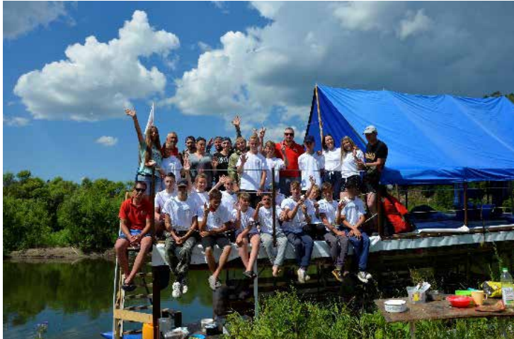
Campers and staff on the river raft.

Summer camp uses unique rafting trip to help focus on Jesus