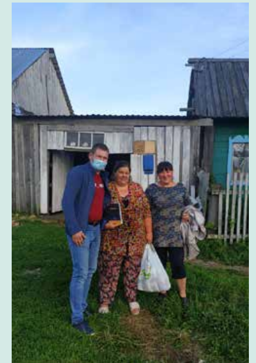
Distributing Bibles and aid in Tomsk Oblast, Russia.

Yet you are a vitally important part of their ministry. Your gifts help to support their work. And your support undergirds children's ministries, the distribution of Russian-language Bibles and Christian literature, Bible training, Compassion Ministry, and the kinds of outreach you read about in this Good News Report. Thank you! Please pray about how you can help today to influence lives for eternity. ♦