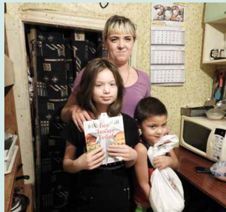
Immanuel's Child reaches entire families with the Gospel.

Russian Christmas is celebrated January 7—only a couple of months away. That means Immanuel's Child Christmas outreaches to children are coming soon. And when you consider that more churches across the former Soviet Union are also holding Christmas celebrations on Western Christmas December 25, that means the time is even shorter!