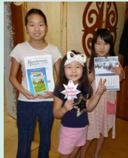
Three girls receive Immanuel's Child stars and gifts in Yakutsk.

Most important of all, the children and their families hear a clear presentation of the Gospel as they learn the true story of Christmas from God's Word. So please, begin intercessory prayer in advance for this wonderful ministry, asking the Lord to prepare the way and draw many to Himself in saving faith. We are trusting Him to show us " great and mighty things " (Jeremiah 33:3)! ♦