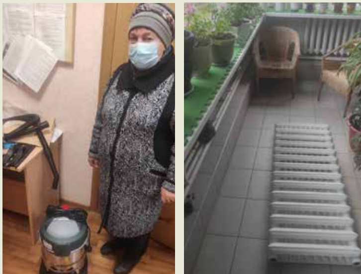
New vacuum cleaner and radiators for the orphanage.

Once we had a call from the orphanage in a nearby town. They asked if we could help to buy a vacuum cleaner as their only one had broken. So