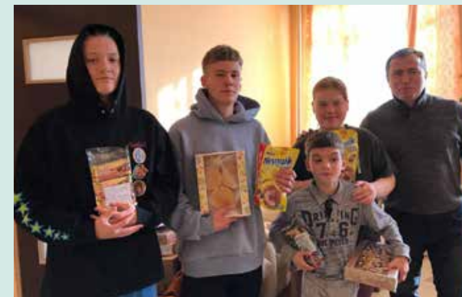
An Orphans Reborn leader brings gifts for the children in the orphanage.

You are truly making an eternal difference in countless lives. Please pray about how you can help today. ♦