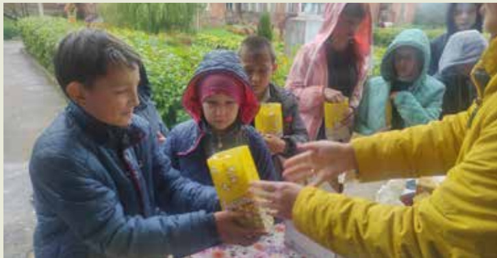
Popcorn snack for the orphans.

SGA-Sponsored Orphans Reborn Team Smolensk, Russia