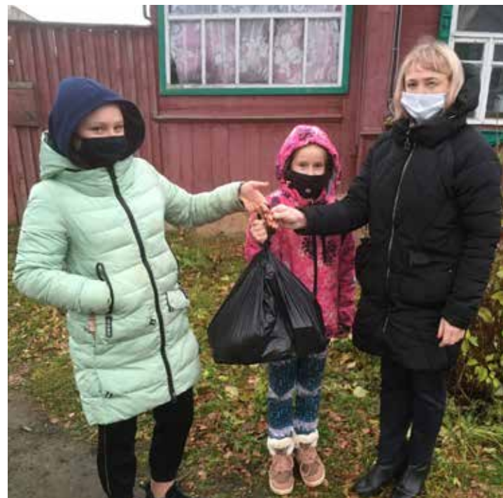
The Krasnoyarsk Orphans Reborn team continues to support orphans after they graduate by delivering bags of groceries for them and their children.