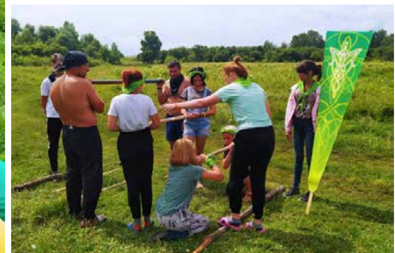
Orphans Reborn teams plan many outdoor activities for the children.

impossible to help them in our own strength, but what is . . . impossible with man is possible with God (Luke 18:27). We keep inviting older orphans to