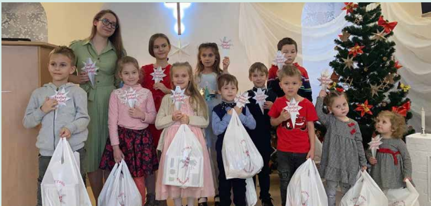
Children with their stars and gifts at an Immanuel's Child outreach.

Each Christmas is a time of rejoicing for the ministry that takes place through the SGA-supported Immanuel's Child outreach, but even more so this past Christmas. With the prayers and support of SGA partners, a record number of children were reached across the former Soviet Union. This is especially amazing when you consider that much of the world was still dealing with the COVID-19 pandemic and varying degrees of restrictions.