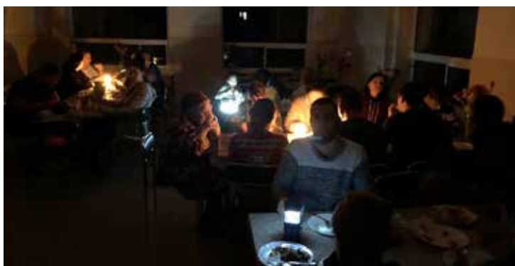
Faculty, students, and local residents gather for dinner at the seminary while the fighting continues outside.

For weeks, the world heard the news about the Russian military buildup along the border with Ukraine. And the “rumor of war” indeed spread—until February 24, 2022, when the rumor became reality. Russian troops went into Ukraine from several fronts, and a new round of violence,