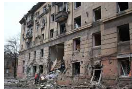
Destruction in Ukraine.

As this issue of the Good News Report was going to print, there has been violent conflict between Russia and Ukraine. As is usual when there is military confrontation in the former Soviet Union, SGA is often asked by media and others to provide our viewpoint on events. Our viewpoint is largely what it always has been—to serve the evangelical churches of the former Soviet Union as they lovingly proclaim the life-changing Gospel to their people , and to avoid getting drawn into political controversy as much as possible.