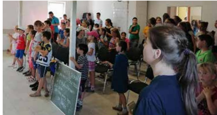
56 Children and 26 adults participated in the camp.

Most importantly, at the end of the service on the third day, nine children prayed a prayer of repentance. These children's hearts turned to the Lord. They all were praying, crying, asking for forgiveness from God, and for help to follow Him. Please support these young souls in prayer so that this desire does not fade in their hearts until the