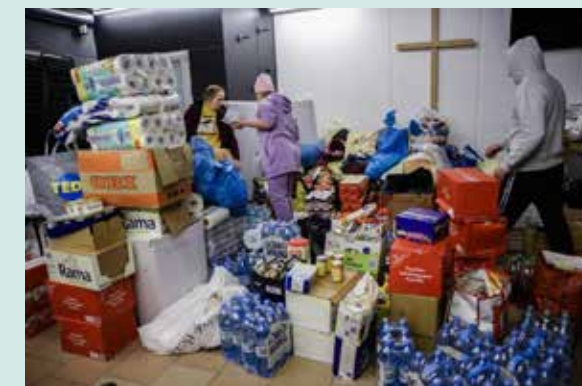
Aid for displaced Ukrainians.

The war between Russia and Ukraine breaks our hearts, sharing the sorrow of the Bible-preaching churches we serve in both nations, and across the former Soviet Union. This situation no doubt changes many ministry plans, but we serve a sovereign God whose purpose will be fulfilled no matter what obstacles sinful man throws in the way. We hope to report more on upcoming summer camp ministry next month, all the while praising and thanking the Lord for His gracious provision for all SGA-supported ministries—including Bible training, Russian-language Bibles and Christian literature, children's ministries, Compassion Ministry, and so much more. Please pray about how you can help today! ♦