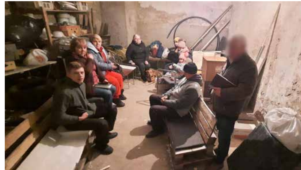
Believers worshipping in a bomb shelter.

Immediately, we knew that SGA would have to act swiftly. Our Regional Ministry Center (RMC), Irpen Biblical Seminary, and the lives of many SGA-sponsored missionary pastors were in grave danger as the bombs began falling. We are thankful to God that our staff, and the Irpen faculty and students, were able to evacuate, yet some of the seminary staff decided to remain behind so that the school could function as a temporary shelter for local residents amid the bombing. Yet even as they evacuated their wives and children, missionary pastors and their churches across Ukraine were already making ministry plans. They knew that thousands, if not