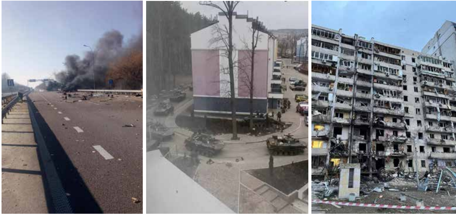
(L to R) A burning bridge; military tanks in the street; a residential building hit by shelling.

And you will be hearing of wars and rumors of wars. See that you are not alarmed, for those things must take place, but that is not yet the end (Matthew 24:6).