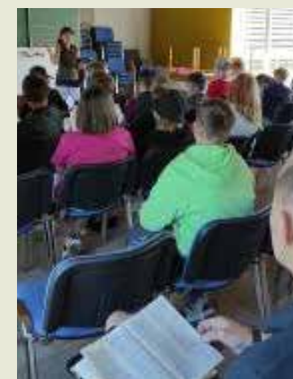
Studying the Bible.

The session for teenagers began in August and lasted for 15 days. A pastor from a nearby city led the Bible lessons. He talked about nominal believers in the