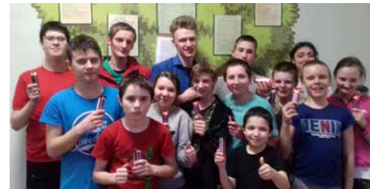
The children with their chocolate bars.

In late March, we were invited to come to Taganrog again to minister to refugee children.