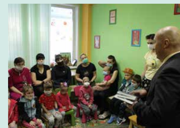
Bible lesson at an orphanage.

The SGA-supported Orphans Reborn outreach across the former Soviet Union continues to be used by God to make an eternal difference in thousands of young lives. The past few years have seen many challenges and hurdles, from the COVID-19 pandemic to the awful war in Ukraine.