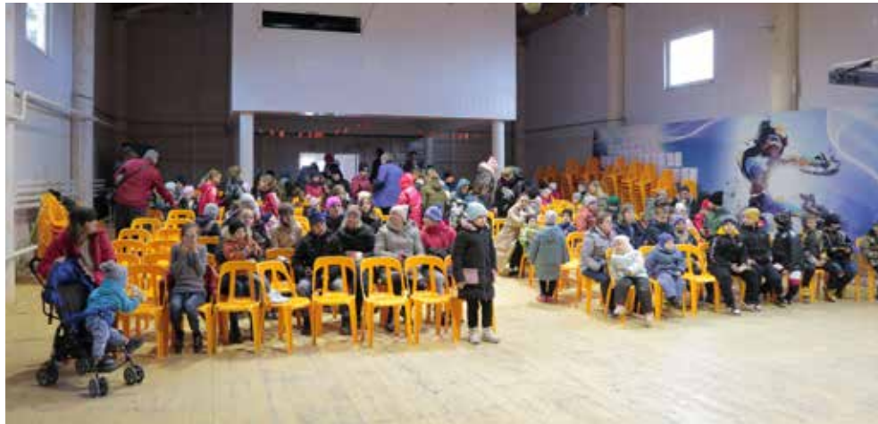
Children and their parents gather for the drama performance.