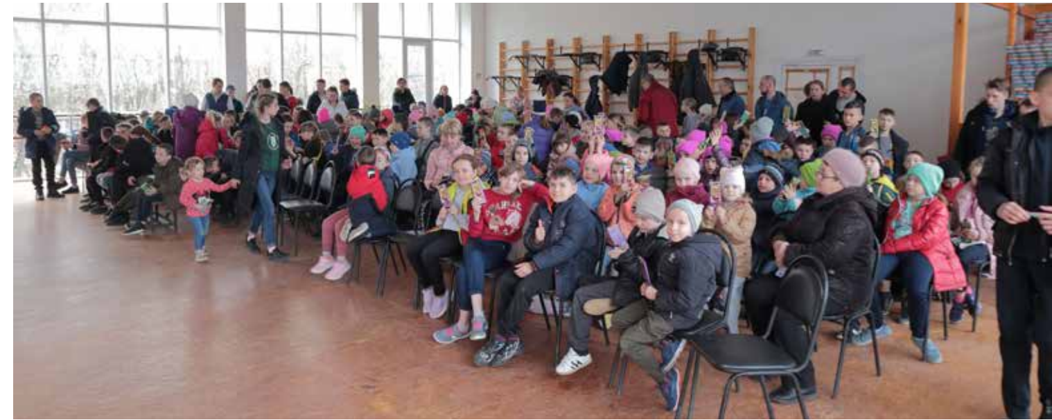
Hundreds of people were reached through the performances.

that people remembered her because of her kindness to her mother-in-law Naomi. And God rewarded Ruth. She became the great grandmother of the king. She also became a part of the Christmas story. Joseph and Mary were descendants of Ruth and Boaz. They came to Bethlehem because that was where the family estate of Ruth and her husband was.