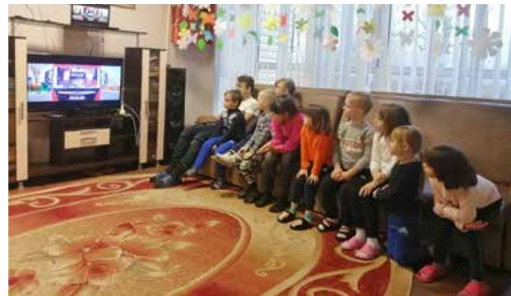
The children at the orphanage watch the recorded drama with interest.

It is about a girl who married and then was left a widow with her husband's parents. She fled from that home and from these elderly people who were not her blood family. She hitch-hiked and that was how she met a long distance truck driver. He listened to the young woman's story and shared with her the story of Ruth from the Bible. Then he brought into focus the fact