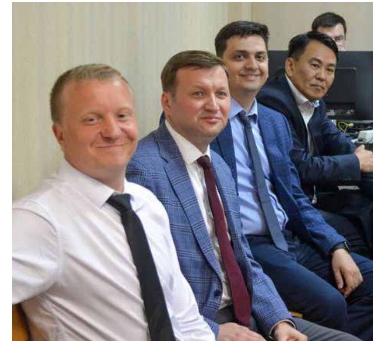
Students at Novosibirsk Biblical-Theological Seminary.

As God provides and leads, we are praying that this eventually develops into the Far East Training Center. Also, they have started the second group of students at their extension center in St. Petersburg , which is also growing and in demand. Extension centers continue to be supported in Ufa, Voronezh, and Irkutsk . Also, a college-level education program for the deaf is planned for this fall. In addition to all this, SGA is assisting five students from Yakutia in their studies at NBTs, and officially this May the churches in Yakutia have joined the Russian Baptist Union.