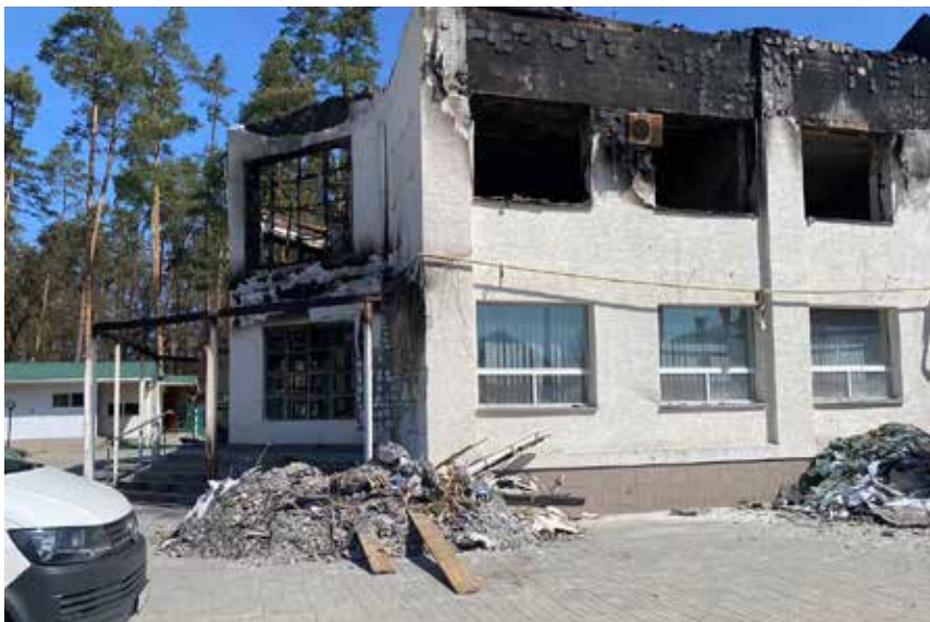
Irpen seminary was hit by 50 mortar rounds, but with the help of volunteers, the debris has been cleared and the roof sealed.

When the Russian military invaded Ukraine in February, all of the plans at Irpen Seminary had to change. It was devastating.