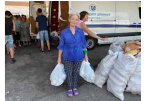
An SGA-supported team provides aid to people in Ukraine.

We will continue helping the churches reach refugees with aid and the Gospel as God provides. Please pray with us for peace to come at last to this war, which has now raged for six months. ♦