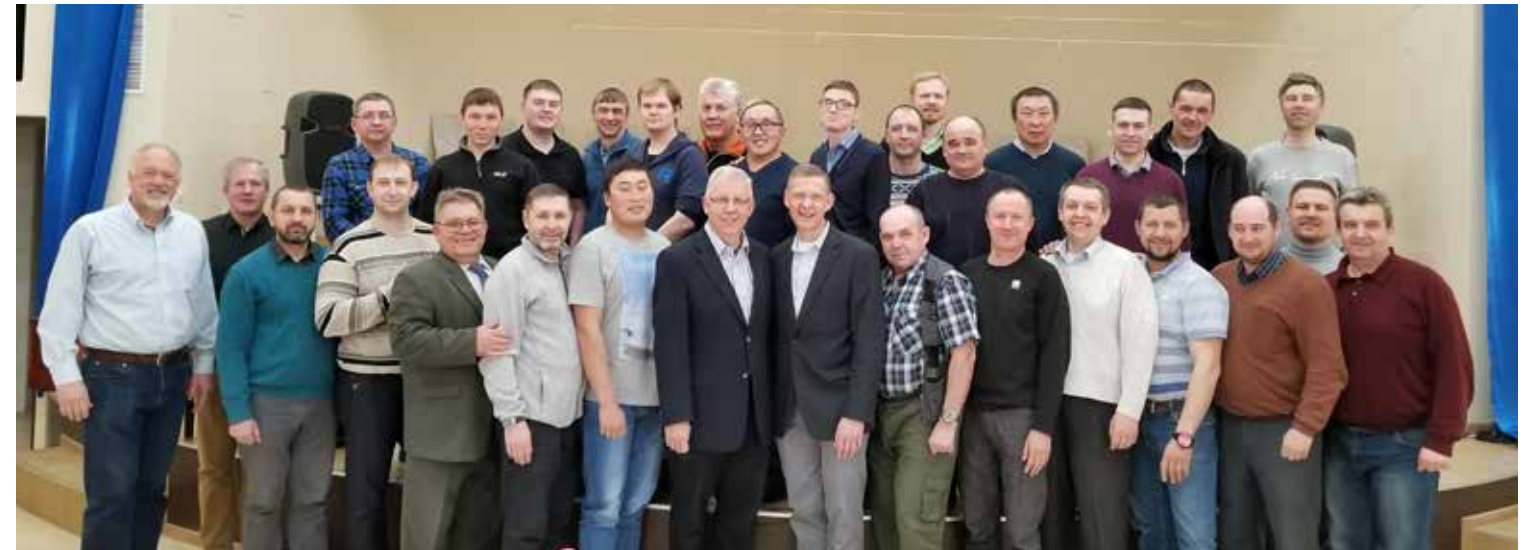
Graduates of Antioch Initiative training in Irkutsk.

Your support spurs rapid expansion of qualified, life-changing lay teachers