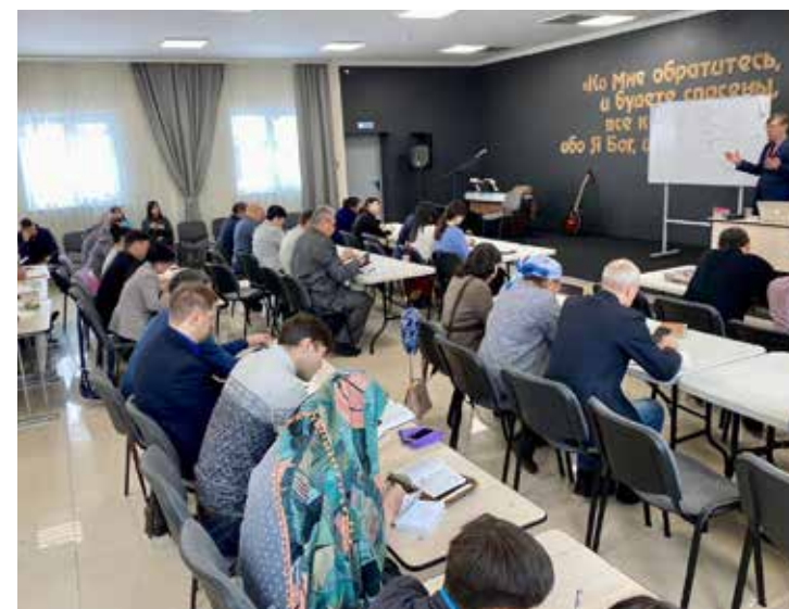
Forty-five men and women participated in Antioch Initiative training in Tuva.

Due to the invasion of Ukraine, we were unable