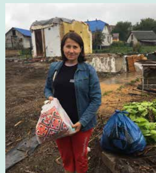
A Ukrainian woman receives aid through SGA-sponsored Compassion Ministry.

The reports and testimonies regularly sent to us by faithful SGA-supported missionary pastors across the former Soviet Union never cease to inspire us and encourage our hearts. They have always faced