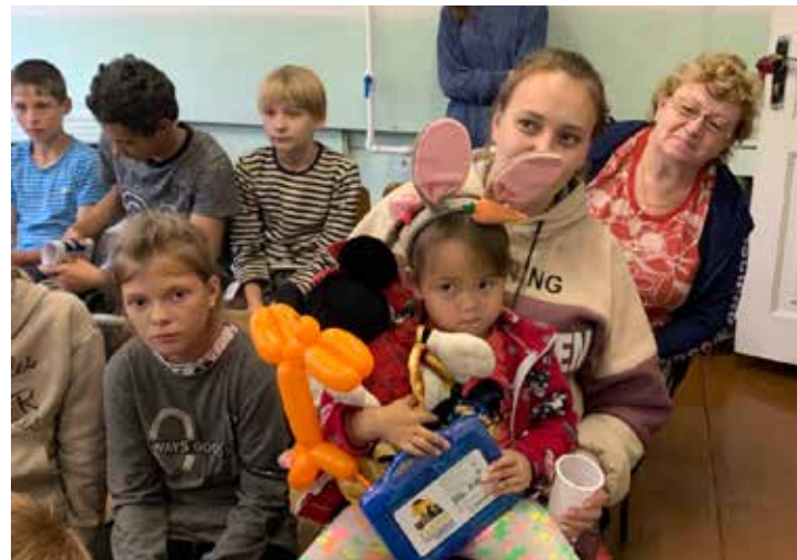
The program was attended by many children and adults.

Unknown to us at the time, God had other plans for us and for the director of the school. Upon our arrival at the village, which was delayed by a couple of days due to weather, we came to the place of our lodging. To our great surprise, the director of the school met us at the lodge as we drove up. She explained that because of poor weather conditions the scheduled helicopter (the only means of transportation in and out of the village) had not come for the last two weeks, and she was not able to leave as planned. She invited us to hold the outreach at the school, and after seeing the condition of the club house, we gladly agreed!