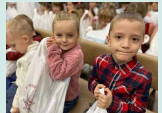
Children attend an Immanuel’s Child Christmas outreach.

We’re expecting a record number—at least 60,000 children! Your faithful support makes so much more possible—distribution of Russian-language Bibles and Christian literature, doctrinally sound Bible training, Compassion Ministry, children’s ministries, and missionary pastor support. Please prayerfully consider how you can help today! ♦