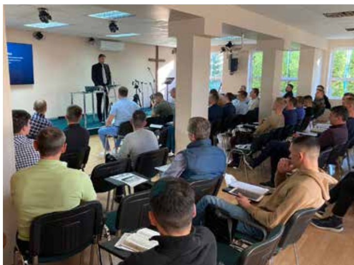
Irpen Biblical Seminary has reopened and students are attending classes.

In addition to the worship center, the kitchen and library sustained relatively minor damage compared to the upper floors of the school, and the students are meeting for classes on the first level, with 50 students attending each session. We praise and thank our God for His protection and provision, and you—our faithful partners—for your prayers and support.