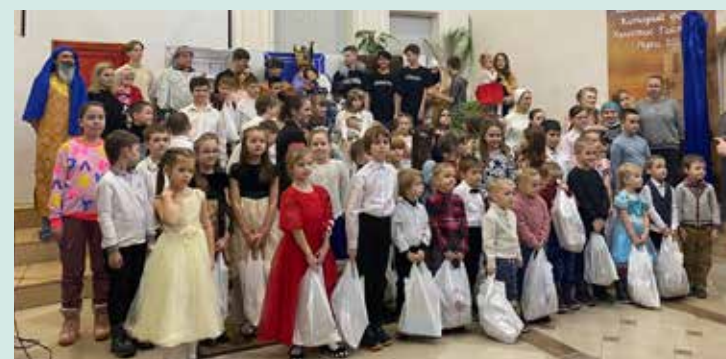
Children at an Immanuel's Child Christmas outreach.

But in addition to financial support, prayer is just as important. So as we celebrate the 20th