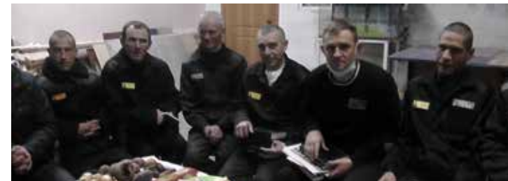
Prison Bible study group.

Brothers and sisters, I greet you in the name of our Lord Jesus Christ! I recently finished serving my fifth prison sentence in a facility near the Russian city of Novosibirsk. I wanted to give my testimony and share with you what God has done in my life. I just pray that my story will be useful for the newly saved, as well as for those who have not repented before God yet.