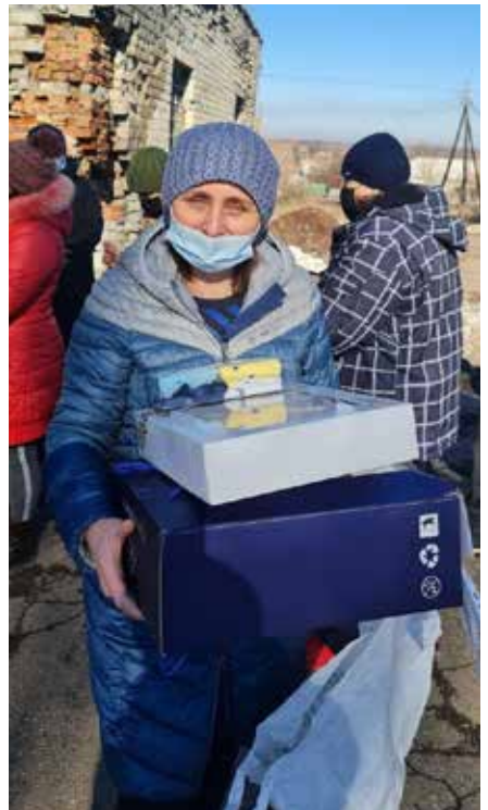
Above and Top: People are grateful to receive winter warmth kits.

In addition to Ukraine, deep needs such as this exist across many regions of the former Soviet Union such as Central Asia—where countries like mountainous Tajikistan and Turkmenistan are located. As this winter continues, please lift up the faithful pastors and churches as they minister to the needs of their people and share Christ's love. Also pray for the increased resources needed due to the demands created by the war in Ukraine. We praise and thank the Lord for each of you—our faithful partners—and for all that you help accomplish for the glory of Christ! ♦