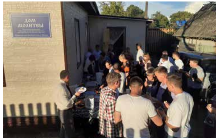
Fellowship at the dedication of the House of Prayer.

people, inviting them to the church and telling them about Christ. And beginning this month, I plan to start a new group of preparation of new brothers for ministry in churches, following the program "Fellowship around the Word." Please pray for this new group of brothers who are preparing for ministry.