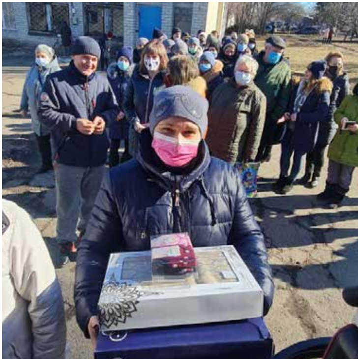
Above and Top: People stand in line to receive aid.

My help comes from the Lord, who made heaven and earth (Psalm 121:2).