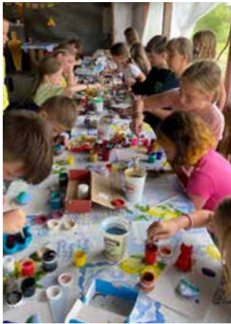
Making crafts at the camp.