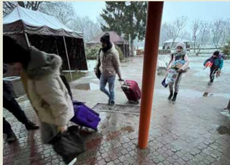
Refugees arrive at the camp.

SGA partners have helped support the Little Pearl Camp in Belarus for many years now. Since its beginning, the camp has helped thousands of children with illnesses related to residual radiation from the Chernobyl nuclear disaster, receiving initial diagnostics and limited treatment. But since the invasion of Ukraine in February 2022, the camp has found yet another way to minister the love of Christ by helping fleeing refugees driven out of their homes by the war.