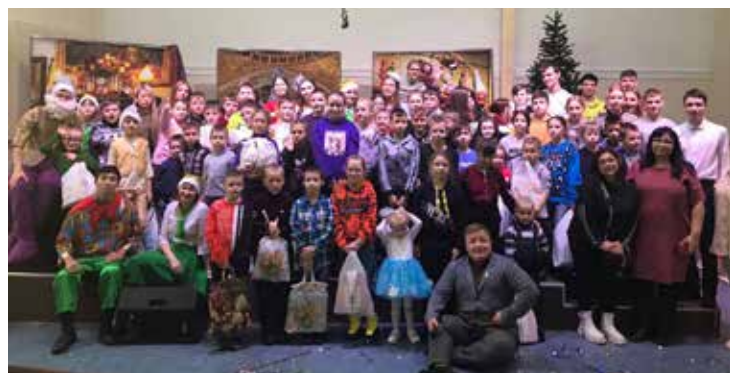
Celebrating Christmas with orphan children.

We resumed praying for the orphanage in another village, asking God to open the doors for us there. However, we were not able to meet with the headmaster of the orphanage before the Christmas holidays as she said the orphanage was on quarantine, and vacations were already scheduled. Instead, she invited us to hold our Christmas program after the holidays. We trusted God, bought gifts, and held the Christmas celebration for the other three orphanages