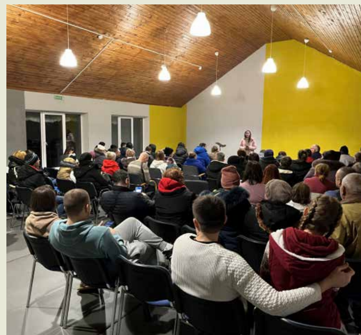
Meeting with refugees.