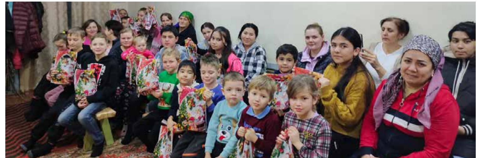
Children at the Christmas service.

... for a wide door for effective work has opened to me, and there are many adversaries (1 Corinthians 16:9).