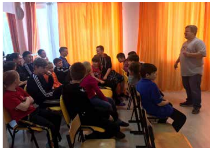
Meeting with children at the new orphanage.

A week later, we signed an agreement between our church and the orphanage. From now on, every week the Word of God will be heard in one more place! Everyone who was in the orphanage and even the teacher attended our outreach. We talked about Christmas again. Then we had tea and a long conversation, and the children did not want to let us go.