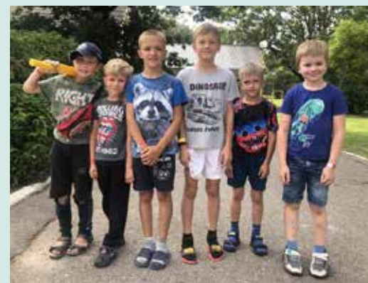
Boys at a summer camp in Belarus.

Each year, we look forward with joy and eagerness to see what God will do through SGA-supported summer camps, and through your generous support of them. Through the years, so many young boys and girls came to know Christ as their Savior and Lord through these camps. They also open