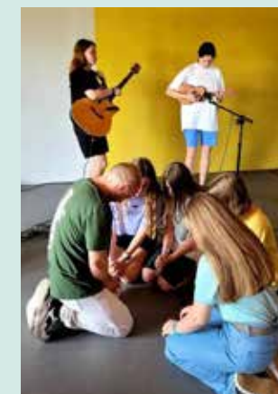
Praying and worshipping during a Bible camp.

the door for follow-up ministry opportunities with the children and their families. You are truly making a difference through these outreaches, and all the other SGA ministries you help sustain—Bible training, Compassion Ministry, ministry to orphans and other children’s ministries, distribution of Bibles and Christian literature, and so much more! Please pray about how you can help today! ♦