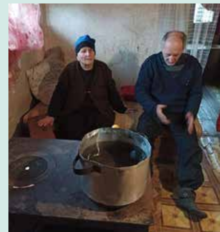
Visiting a family with a grocery pack.

SGA-supported missionary pastors across the former Soviet Union wear many hats. They lead their churches in worship, preaching and teaching the Word of God. They make disciples. They lead teams out into the towns and