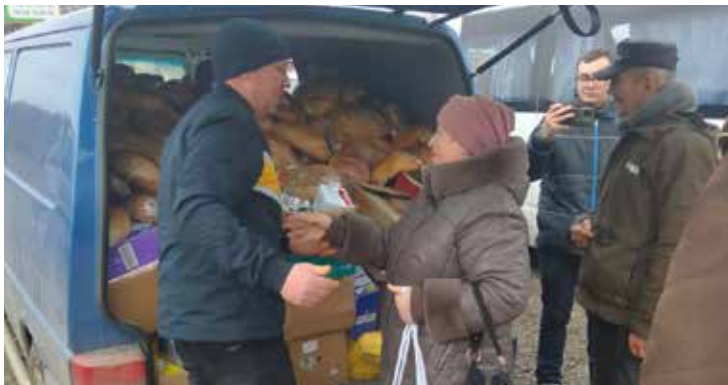
Distributing bread and other products.

Greetings in the Lord! By the grace of God, we are among the living and can serve with you in the field of God. I am writing to you how God has blessed me and my family during this difficult period.