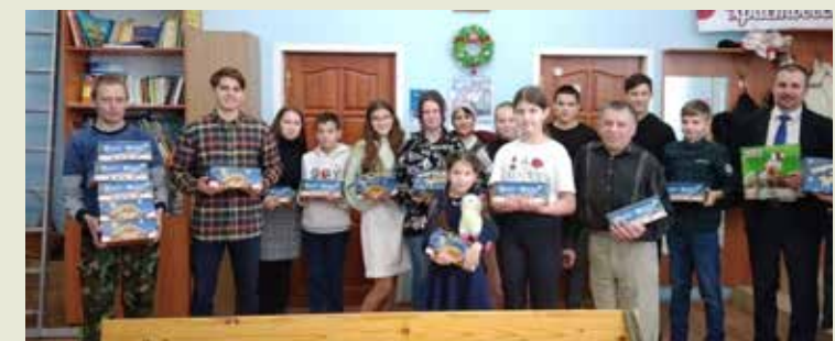
Providing gifts for families in the church.

We thank SGA partners for the blessings! Please keep praying for our ministry! ♦