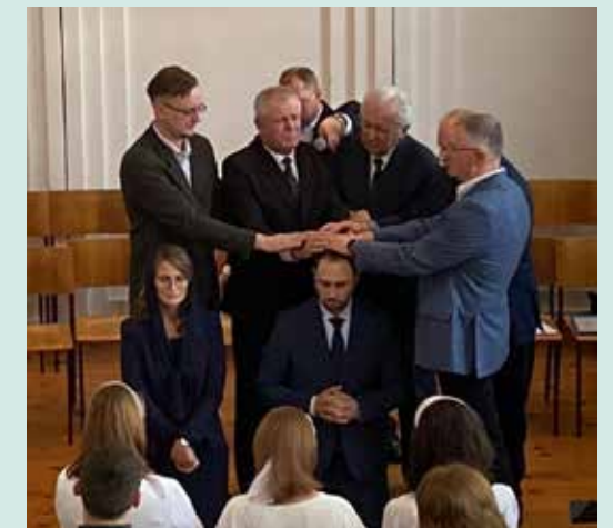
Believers pray over a man, blessing him for pastoral service.

villages with food and other aid, along with the Gospel. They evangelize one-on-one during home visits, and lead children’s ministries. Your prayers and faithful support mean so much to them. And your gifts accomplish so much else—provision of Russian-language Bibles and Christian literature, Bible training, children’s ministries, youth ministries, Compassion Ministry—the list truly goes on. Please pray about how you can help today. ♦