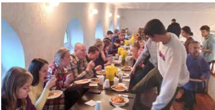
Many volunteers came to help with the Christmas outreach.

We began 2023 with a wonderful Christmas ministry held at our village club with help from Calvary Church in Minsk. Several brothers came a day early, prepared the scenery, worked hard, and then the next day a large team of over 60 people came. It was a big surprise to the club director. She wasn't expecting such a large scale event! But that wasn't the most important thing, the most important thing was that people heard about the Savior's birth.