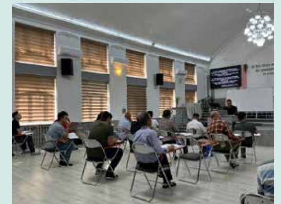
Antioch Initiative in Tajikistan.

Your prayerful, generous support of SGA helps provide this along with Bibles and Christian literature, children’s ministry, food and other humanitarian aid through Compassion Ministry, and so much more. Please pray about how you can help today! ♦