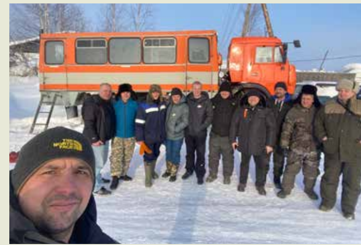
Visiting villages on the Yenisei River.

Together with brothers from the Chita region, we organised a February mission in the north down the Yenisei River. We called it The Gospel to Every House . These are the villages which can be reached only during the winter when the river is frozen. There is no road there in summer. The brothers made arrangements at their work, with some taking vacations while others took leaves of absence. They all committed themselves to missionary work for three weeks. We went far into the north. In one village, we even had to fly by helicopter, which was a miracle from the Lord. We knocked on every door in the village and offered people a copy of the New Testament. We had different reactions, but the further we went from civilization, the more