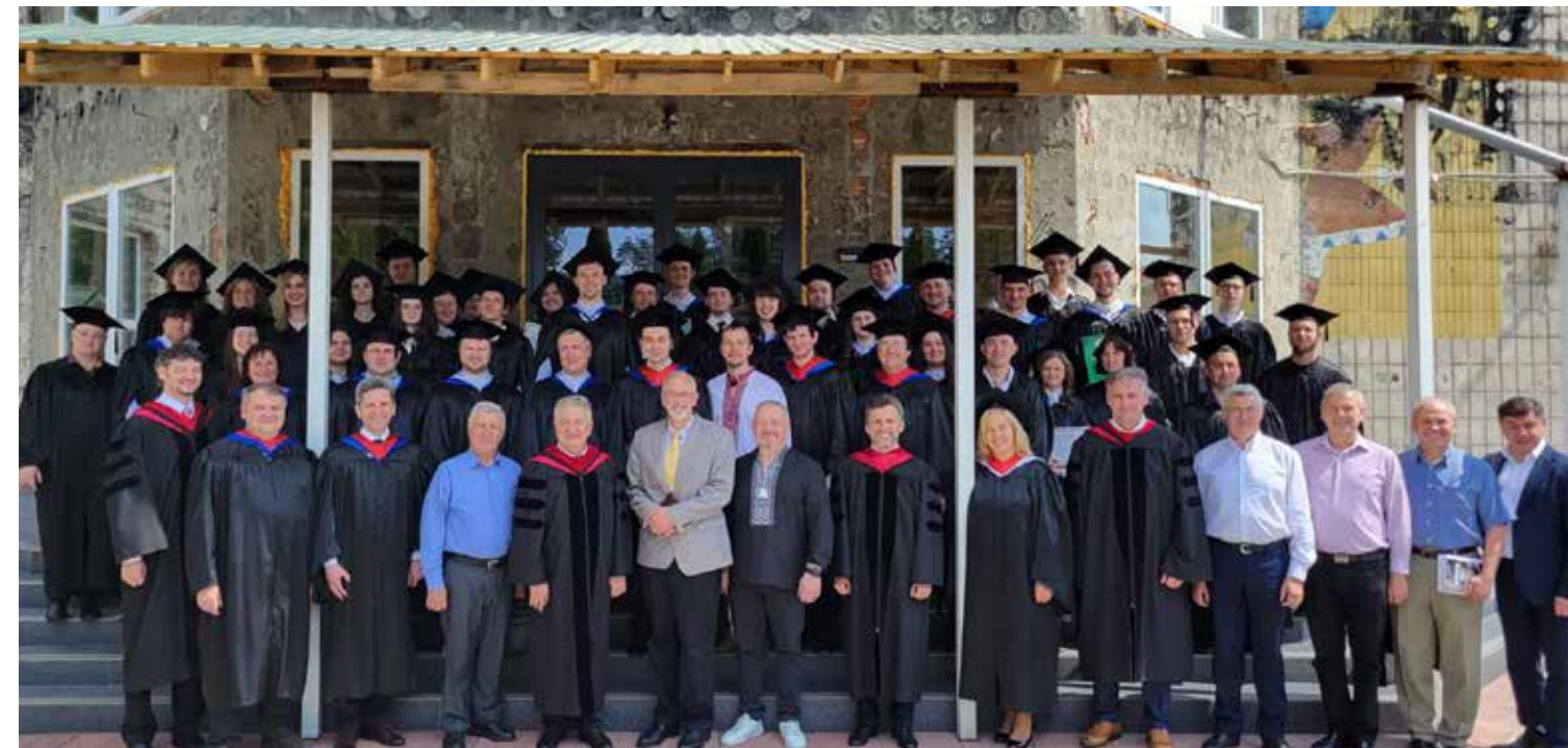
Irpen Biblical Seminary graduates stand in front of the damaged seminary building

My travels this year also took me to the nation of Poland, where many refugees from the war in Ukraine have fled. While there, I met with Polish Baptist leaders and we rejoiced at what God is doing in that country. Last summer, we had talked about all the Ukrainian refugees in Poland and the potential for planting many new Bible-teaching churches. There are more evangelical churches in Ukraine than most any country in Europe, and by God’s grace, they are being spread to the ends of the earth. In the book of Acts, Luke records what happened when the believers were scattered through persecution and adversity . . . Therefore, those who had been scattered went about preaching the Word