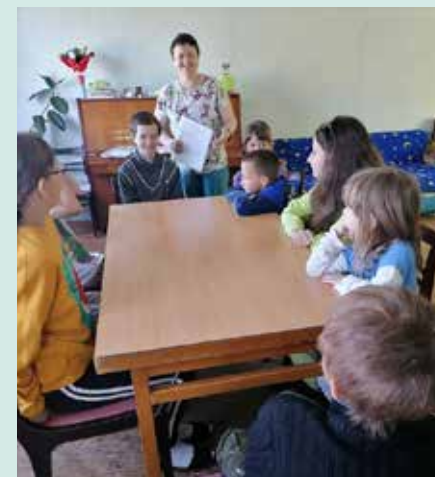
Children’s Sunday school class in the Grodno region of Belarus.

At SGA, our highest priority has reflected the highest priority of the evangelical churches we serve across Russia and her neighboring countries—the provision of biblically sound Bible and theological training for pastors, church-planting missionaries, worship leaders, youth and children’s ministry leaders, and lay workers.