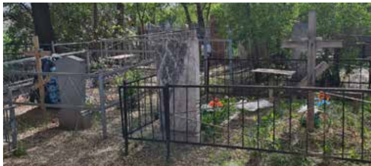
The cemetery where the man was living.

"I took my mother to visit her relatives a long way away, as she had asked me to take her there one last time. She ended up hospitalized there, yet God had everything under control. I was sent a photo and a video of a man who lived in a cemetery there. He had no documents and was missing one leg. While my mom was in the hospital, I attended a church service on Sunday, after which I felt a strong impulse to meet the man. I tried to push away such thoughts, but they seemed to come over me.