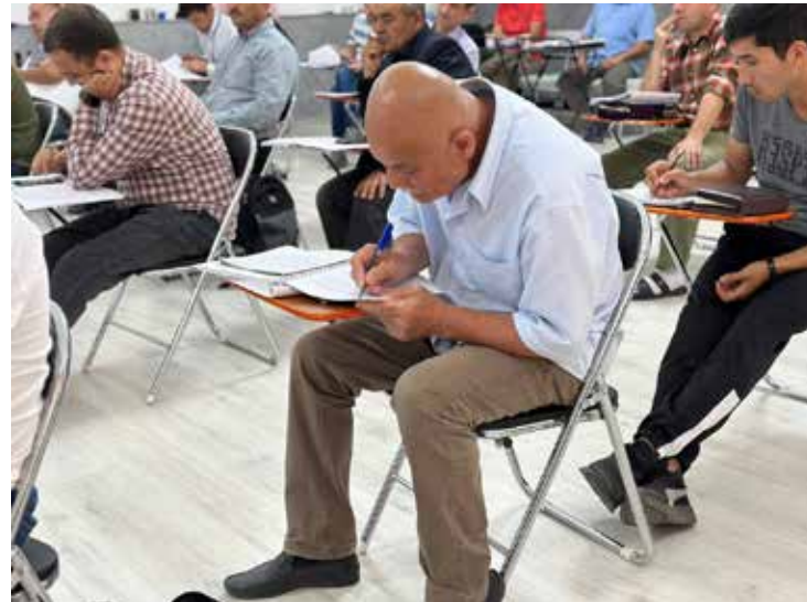
A man takes notes during a Hermeneutics class in Tajikistan.

In the nation of Tajikistan , 38 students are enrolled in Hermeneutics, which teaches the principles, practice, and research of accurately interpreting God's Word. The session stresses a foundation in prayer, asking the Lord to keep His pastors preaching only the Word of God, that the Word penetrates the hearts of those who hear and those who preach it, and that the young pastors will serve well as they prepare their sermons from Scripture. The session was taught by a Russian-speaking instructor, and was only the second Antioch session since COVID restrictions ended. The men enrolled—including a number of younger brothers—