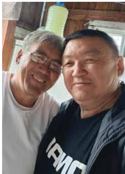
At the rehabilitation center.