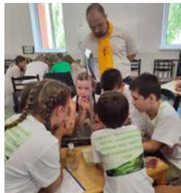
Bible Quiz at the camp.

from across Belarus gathered there. As a result, there were 13 teams. Children demonstrated their knowledge of the Book of Luke and performed different tasks. Our children managed to take 8th place. We thank God for helping us to bring children to such events. Through them, the children grow spiritually and get to fellowship with other believers. We thank the Lord, remembering you constantly in our prayers. Thank you for being with us in our labor. May the Lord bless you abundantly! ♦