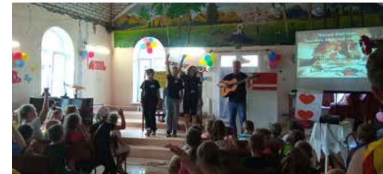
Singing together during the VBS.

of the Gospel. Most of all, we prayed that the Holy Spirit would move in their hearts so they would receive Jesus Christ as their Lord and Savior. Praise God, more than 25 children prayed in repentance at the end of the VBS. About 15 new children wanted to enroll in Sunday school, and some of them came to our church immediately on the first Sunday after the VBS!”