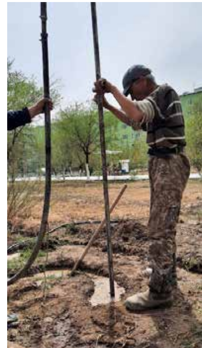
Drilling the well.

to another school, and she again asked us for help. Again, love was shown by good deeds! We had a