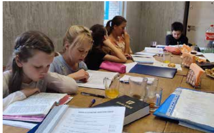
Studying the Bible with children.

We organized a Vacation Bible School at our church. Many children gathered from our village and the neighboring villages in the region. It lasted three days. The children came at 9 a.m. and left at 7 p.m. The outreach was designed so that each child would get to know the Lord Jesus Christ. For this purpose, we printed manuals for the children, which