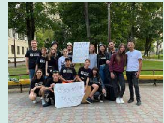
Believing youth in Belarus go out into their city, testifying about Christ to the people they meet on the streets.

We are so very thankful to God for the faithful, dedicated missionary pastors that you help support across the former Soviet Union. They labor in different locations and in greatly differing local ministry environments, but their commitment to preaching the Gospel and bringing glory to Christ is the same. Your prayers and ongoing support is always a great encouragement to them, as is your support for SGA's many other ministries—provision of Bibles and Christian literature, children's ministries, Bible and theological training, Compassion Ministry, and so much more. Please pray about how you can help today! ♦