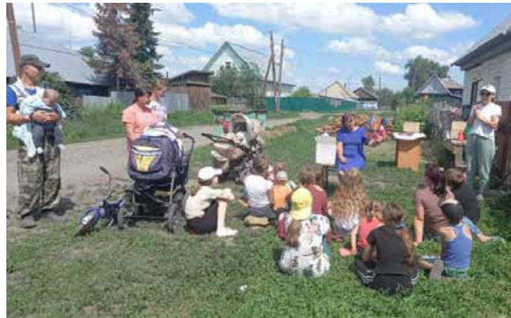
Children and their parents listen to the Bible teaching.

A team from the church in Kemerovo came here to help us with the playgrounds. We had two playgrounds together, with 38 children of different ages playing games, craft lessons, singing songs about God, and listening to biblical truth about Noah, Noah's salvation, and an opportunity to have salvation in Jesus. Some children came