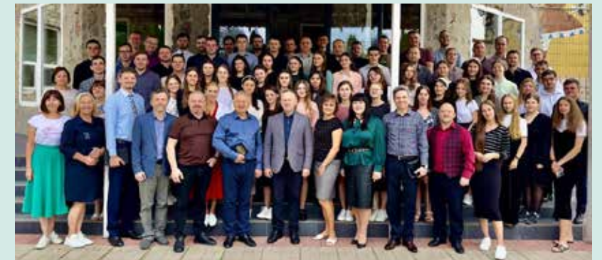
Students and faculty at Irpen Biblical Seminary in Ukraine.

Your faithful partnership helps accomplish so much—Bible training for pastors, church workers, and worship leaders, children’s ministries including summer camps and orphan outreach, provision of Bibles and Christian literature, as well as Compassion Ministry. We are so deeply thankful! Please pray about how you can help today! ♦