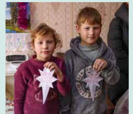
Children in Central Asia with Immanuel’s Child stars signed by partners in the United States.