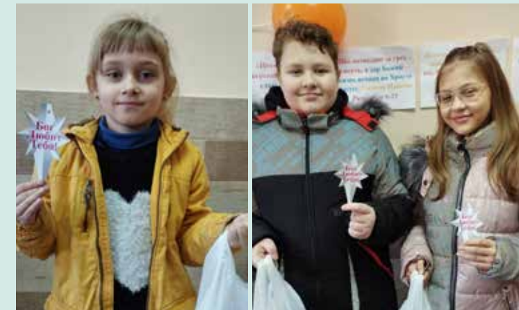
Children with stars and gifts from the IC outreach.

"In addition to the general church service, we greeted the children in person by visiting them and their families. During the Christmas season, people are more open to hear God's Word from believers. On ordinary weekdays, they would not listen and perhaps would not even let us into their homes. But on these days, they are happy to accept us and hear the Good News. There are even parents who ask us ahead of time, "Is there going to be a children's event at church?" One mother said that her children were eagerly asking in advance if there would be anything at church this year—a performance, a puppet program? One woman brought her sons and her friend's children. As a child, she had attended Sunday school